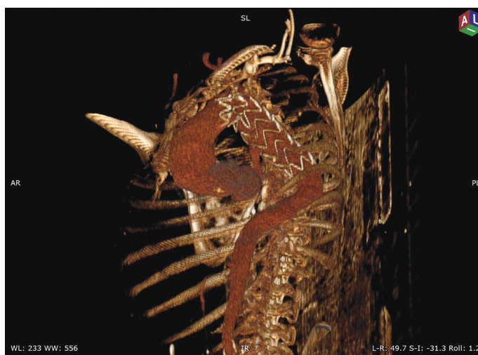
Figure 3. Postoperative CT angiographic view showing the stent graft within the descending aorta

The patient was transferred to the intensive care unit with respiratory support. Postoperative pulses of both the radial and ulnar arteries were palpable. There was no major or minor neurological complication. Routine follow-ups were stable. We decided to perform surgery for the ascending aortic aneurysm in a further session. The patient was discharged without any problems on the postoperative 7 th day. CT angiography was performed on the postoperative 30 th day. There was not any evidence of endoleak in control CT angiography (Fig. 2, 3).