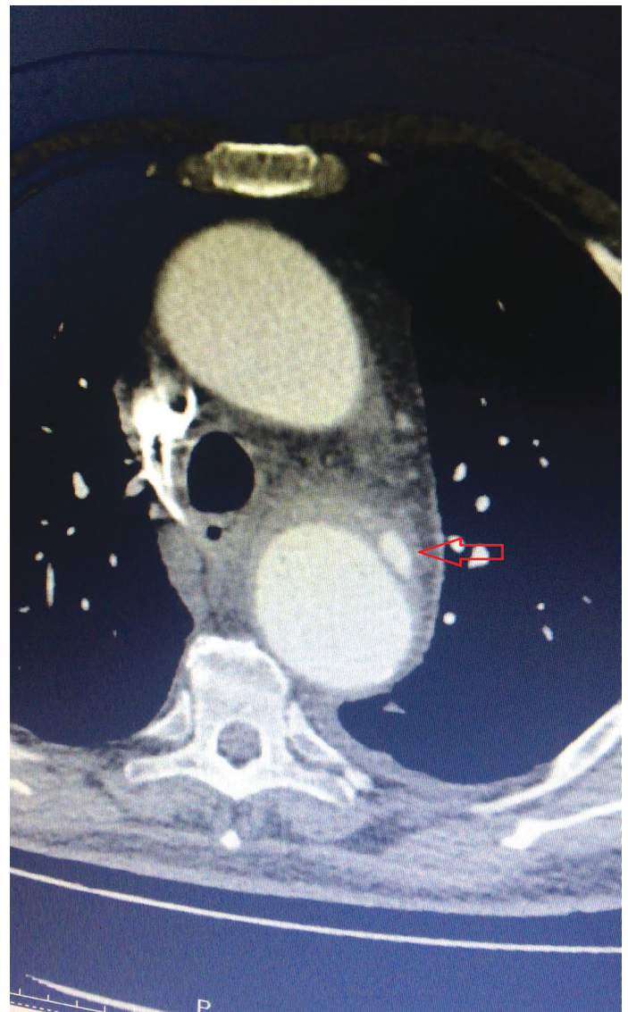
Figure 1. Preoperative CT image of impending rupture

from a common trunk from the aortic arch, and there was no aneurysmatic dilatation in the aortic arch. Ascending aorta aneurysm, reaching 60 mm in diameter at the largest, was detected. Aortic regurgitation was not detected in transthoracic echocardiography. Aortic arch was not aneurysmatic. The patient was evaluated in cardiovascular surgery and invasive radiology joint council. Due to the character of the back pain, only an emergent surgical intervention to impending aneurysm rupture at descending aorta was decided. Endovascular repair to the descending aortic aneurysm was planned. The occlusion of the left SA orifice was planned after it was considered that there was not enough neck to position the proximal stent graft. The right SA was aberrant, and the orifice of the right aberrant SA was within the aneurysm sac that was going to be occluded. It was decided to bypass both SAs. Since the patient had ascending aortic aneurysm, and this aneurysm had an elective surgery indication, an extra-anatomic bypass was de-