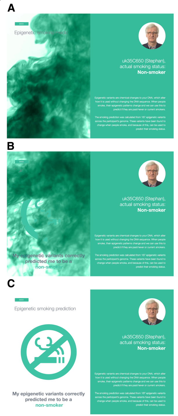
Fig. 3 Time series ( a-c ) of screens showing how GenoME communicates epigenetic SNVs associated with the participant's smoking status. PGP-UK participant uk35C650 self-identified and consented for his photos to be used

complemented by integrated music elements to enable people with compromised sight to experience genetic variation through sound. Figure 3 shows a similar sequence of three screens for the prediction smoking status based on