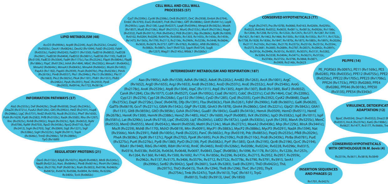
Figure 3 List of Identified Targets. The distribution of the functional classes of the 451 targets identified in the H-List. The number of targets present in each of the functional classes is also indicated.

the targetTB pipeline is given as supplementary material [See Additional file 7].