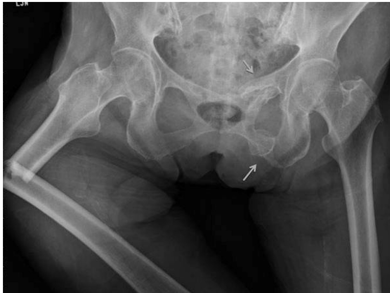
Figure 5. 85-year-old woman on bisphosphonate therapy. Post-fracture radiograph depicts a severely-angulated, simple, transverse, subtrochanteric femoral shaft fracture at the junction of the proximal and middle thirds that extends through the middle of the triangular cortical ridge seen on the earlier studies. Old, healed fractures of the superior and inferior rami of the left obturator ring are also evident (arrows).

Nearly one month later, on her way to an appointment to discuss additional treatment options for this lesion, the patient stumbled on a curb. With this minimal trauma, the insufficiency fracture completed. Radiographs of the fracture showed a severely-angulated, simple, transverse, subtrochanteric femoral shaft fracture at the junction of the proximal and middle thirds (Fig 5). Following closed reduction, the fracture is seen to extend through the middle of the cortical ridge seen on the earlier radiograph (Fig. 6).