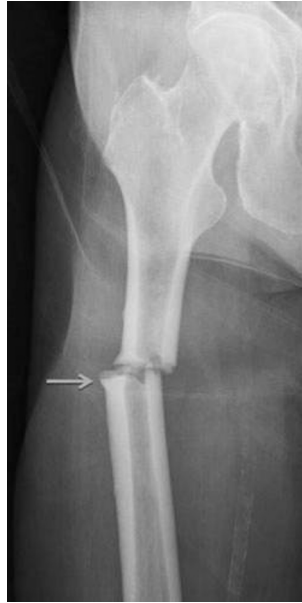
Figure 6. 85-year-old woman on bisphosphonate therapy. Proximal femoral shaft fracture following closed reduction of the marked angular deformity, the simple transverse fracture extends through the beak-shaped region of the insufficiency fracture (arrow). Mild diffuse cortical thickening is also present.

The patient underwent surgical reduction and internal fixation. A relatively long and thick reconstruction nail with two pins in the femoral neck was utilized due to the osteoporotic capaciousness of her intramedullary canal and to prevent formation of proximal femoral neck and distal femoral shaft stress risers which could lead to subsequent fractures. At the time of surgery, a curetted bone specimen was obtained by reaming for intramedullary rod placement. Histological examination of this specimen confirmed the absence of malignant disease.