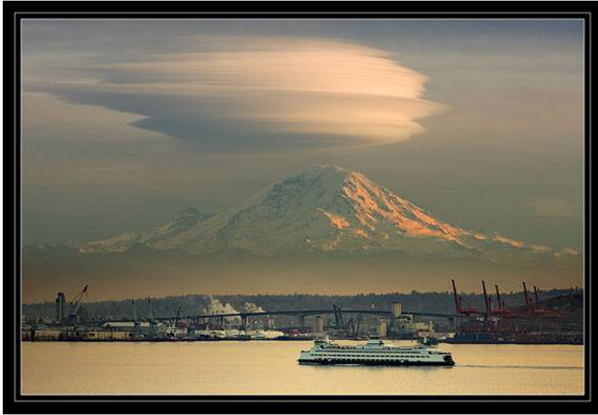
Figure 4. The volcanic mountain peak, Mt. Rainier, as viewed from Puget Sound offshore Seattle, Washington.

Nearly one month later, on her way to an appointment to discuss additional treatment options for this lesion, the patient stumbled on a curb. With this minimal trauma, the insufficiency fracture completed. Radiographs of the fracture showed a severely-angulated, simple, transverse, subtrochanteric femoral shaft fracture at the junction of the proximal and middle thirds (Fig 5). Following closed reduction, the fracture is seen to extend through the middle of the cortical ridge seen on the earlier radiograph (Fig. 6).