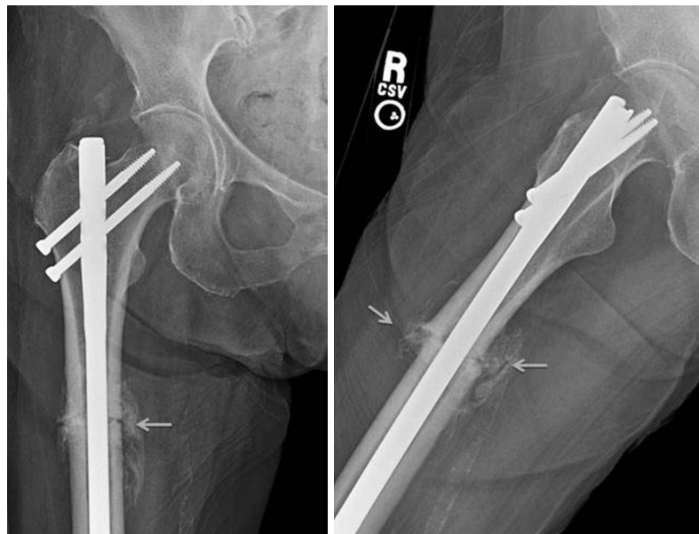
Figure 8. 85-year-old woman on bisphosphonate therapy. Subtrochanteric femur fracture 19 weeks post operative fixation. (A) AP and lateral (B) lateral views with exuberant callus at the fracture site (arrows) in the proximal femoral diaphysis, compatible with appropriate healing.