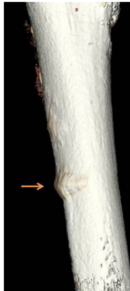
Figure 3. 85-year-old woman on bisphosphonate therapy. 3D surface rendered CT reformation demonstrates the cortical ridge at the antero-lateral aspect of the femur at the junction of the proximal and middle thirds (arrow).