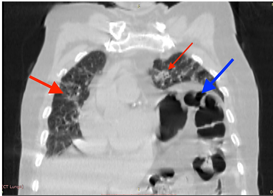
FIGURE 1: Coronal section chest HRCT showing bilateral multifocal peripheral ground glass opacities (red arrows) with a raised left hemidiaphragm showing intestinal gas bubbles in the left hemithorax (blue arrow)