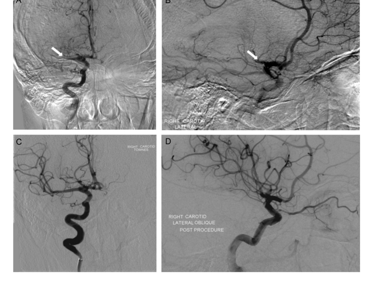
Fig. 2. Successful intra-arterial treatment for an acute thromboembolic stroke involving the right middle cerebral artery (MCA). Pre-treatment digital subtraction angiogram—anterior (A) and lateral (B) views demonstrate proximal M1 occlusion of the right MCA. Defects are shown by arrows. Post-treatment—anterior (C) and lateral (D) views demonstrate recanalization of the proximal MCA and restoration of flow in its distal branches.

However, studies have reported an increased bleeding risk in stroke patients with advanced CKD compared with patients with normal renal function after thrombolysis [88–91]. These studies were all observational and included only small numbers