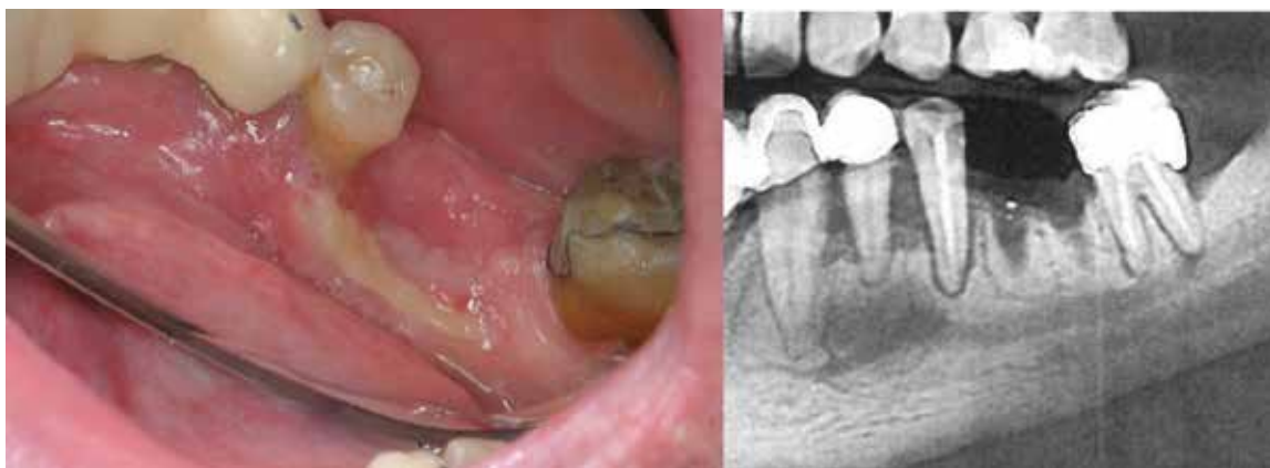
Fig 2: 50-year-old male, HIV+, in treatment for depression and osteoporosis with denosumab (Prolia) for two years. He presented to the clinic because four months ago a lower molar was extracted and it does not heal. The patient was asymptomatic. B: Detail of the OPG showing poor ossification.

In 2008, the first cases of ONJ were published for cancer patients under treatment with bevacizumab (26), in 2009 with sunitinib (27) and subsequently in 2016 with aflibercept (48). Initially, some of the first clinical cases had previous or simultaneously received bisphosphonates and other risk medications. However, shortly afterwards, dozens of new cases started to be published for patients solely treated with these medications (4,18,44).