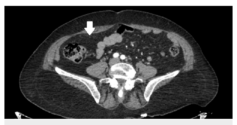
FIGURE 6: CT imaging on the first month of follow-up (the old hematoma area is marked with an arrow)