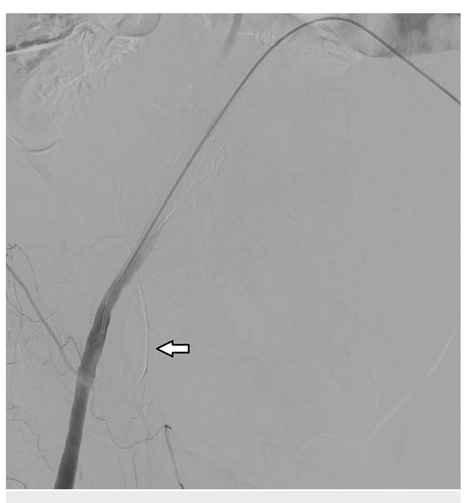
FIGURE 3: Right inferior epigastric artery (marked with an arrow) after embolization