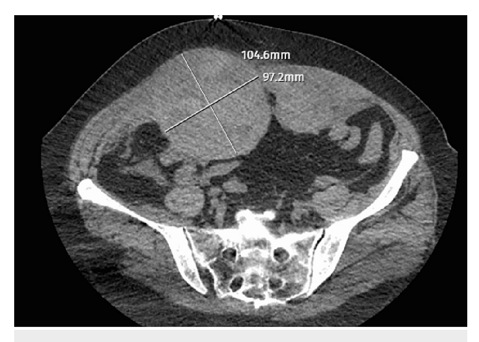
FIGURE 1: CT imaging of the hematoma

ensuring hemodynamic stability with immediate blood transfusion and fluid resuscitation, thoracoabdominal CT and CT angiography were performed. The CT imaging revealed ongoing bleeding due to damage in both inferior epigastric arteries and a giant hematoma of size 104.6x97.2 mm in the rectus sheath (Figure 1).