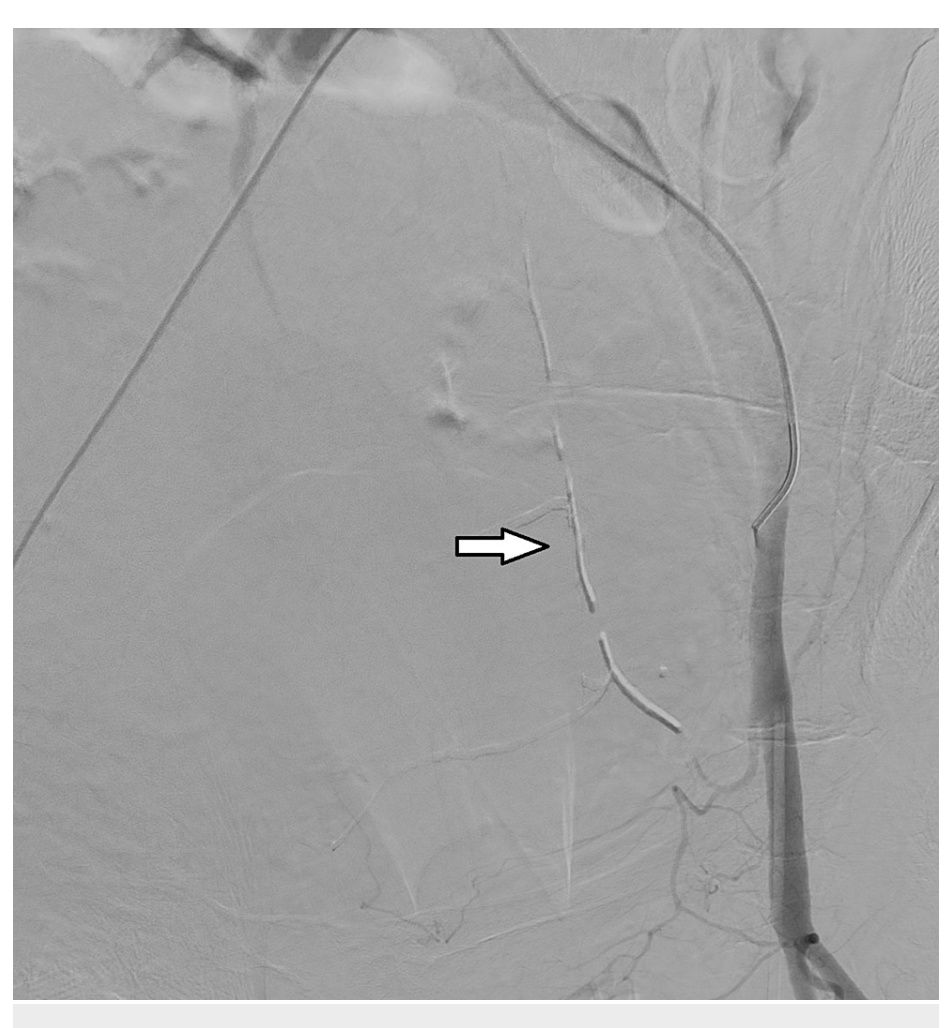
FIGURE 5: Left inferior epigastric artery (marked with an arrow) after embolization

Following the procedure, the patient was admitted back to the ICU. During the follow-up, the patient remained stable and on the fourth day after the procedure, she was taken to the inpatient service where she was discharged on the following day. A month later, a control CT imaging was obtained, which revealed a complete resolution of the hematoma (Figure 6).