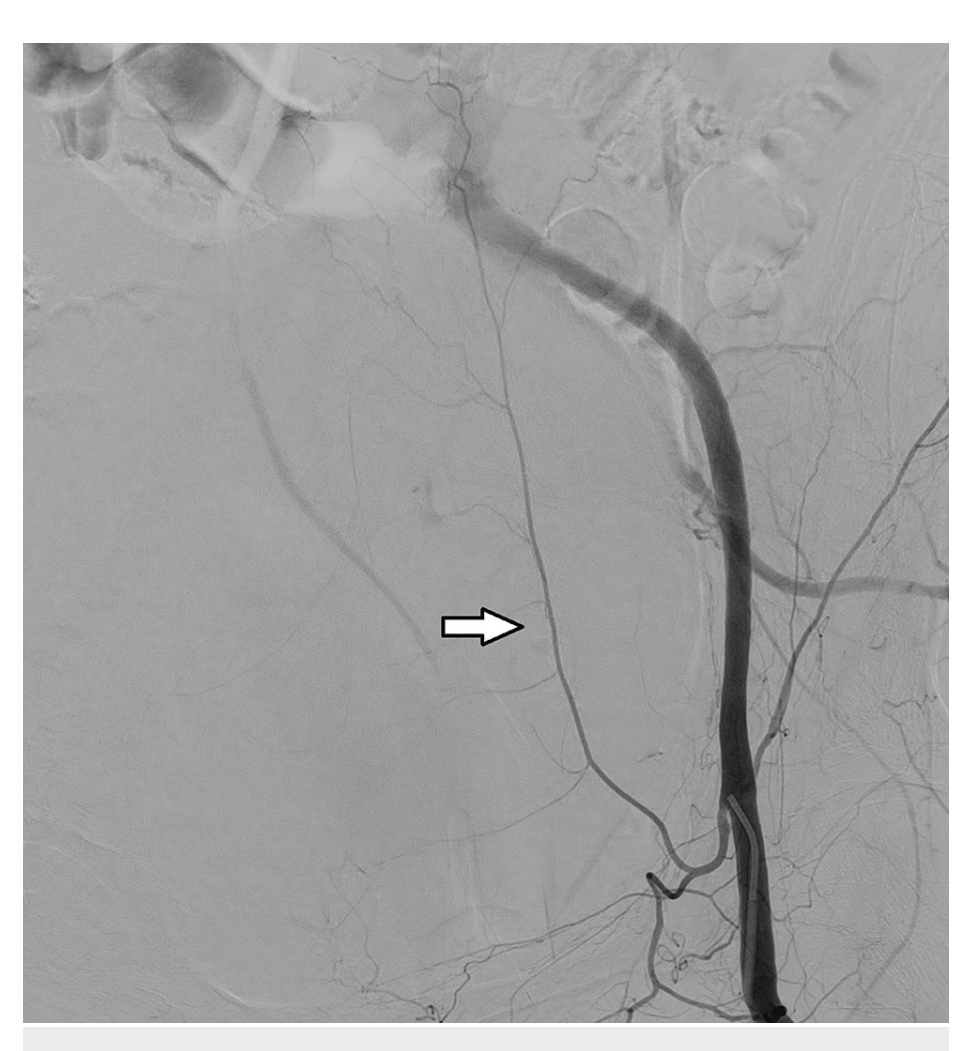
FIGURE 4: Left inferior epigastric artery (marked with an arrow) before embolization