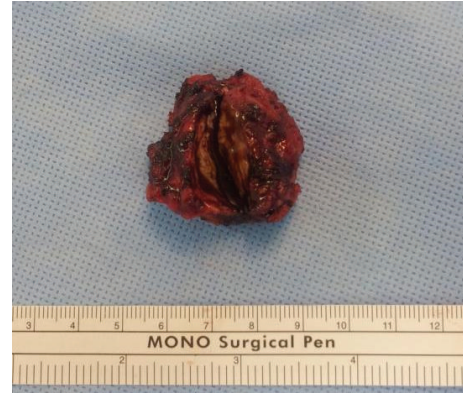
FIGURE 1: A mass of ~3.5 cm was removed. Grossly, white-yellowish-coloured tissue and brownish tissue were observed inside the lesion. A dark-brown-coloured fluid was found upon incision of the lesion.

The usefulness of imaging studies, including CT and USG, as well as fine-needle aspiration cytology (FNAC) is well documented. On ultrasound, AEC appears as a solid, heterogeneous hypoechoic mass with inner echogenic spots. The echogenic patterns are dependent on the haemorrhagic and fibrous components of the lesions. Although the attenuation varied, on CT mild-to-moderate enhancement of the lesion was observed in the abdominal wall close to the C/S scar [3]. Medeiros et al. published their clinical experience of FNAC in nine cases of AEC. They identified clusters of epithelial endometrial-like cells, endometrial-like stromal cells, and haemosiderin-laden macrophages in the lesion.