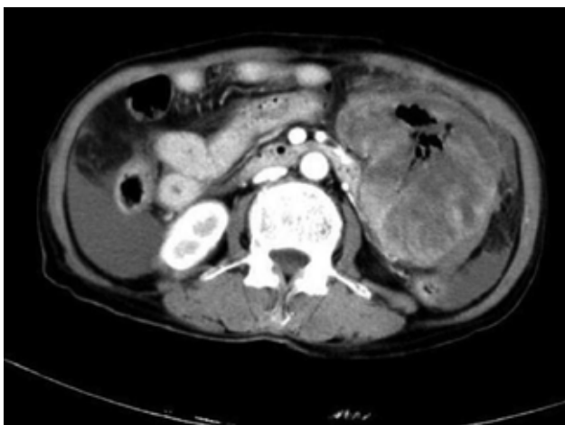
Figure 1. Small-bowel GIST with a diffusely thickened bowel wall. Central portion of the tumor has an area of necrosis, with air present within the necrotic cavity that communicates with the lumen of the small bowel.