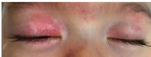
Figure 1 Flat hemangioma of the right upper eyelid.

The diagnosis of secondary open-angle glaucoma associated with SWS was made in the RE; the LE appeared free of glaucoma and the elevated IOP in the LE on initial presentation was presumed to be an artifact of in-office measurement. Two weeks later, at 5 months of age, the child underwent viscodilation of SC and CC and ab interno 360° trabeculotomy RE using the OMNI glaucoma treatment system (Sight Sciences, Inc., Menlo Park, CA). A temporal incision was created in the peripheral cornea. The pupil was constricted with an injection of acetylcholine chloride 20mg/2mL (Miovisin, Bausch & Lomb, Bridgewater, NJ)