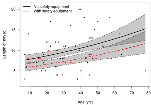
Fig. 1 Effect of age and use of protective equipment on the length of hospital stay after a horse-related maxillofacial fracture. The lines refer to the predictions of a linear regression where length of hospital stay was logarithmized (here the prediction is re-transformed) based on a data set of 55 patients (16 patients gave no information on their protective equipment), according to whether or not they were wearing protective equipment at the time of the accident. The black solid line indicates the patients who were not wearing protective equipment and the red line indicates those who were wearing protective equipment. The shaded gray areas represent the confidence interval (with standard error of the mean)

on four response variables, namely fracture site, operating time, postoperative complication rate, and length of hospital stay.