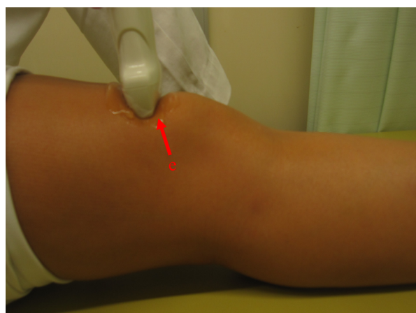
Figure 2 Transverse plane with the echo probe in contact with the proximal aspect of the patella. (a) Synovial membrane thickness. (b) Perpendicular line of the central femoral bone. (c) Cartilage surface. (d) Synovial surface. (e) Proximal aspect of the patella.

(extension, flexion, standing) using one-way ANOVA ( F=0.1705 , P=0.1795 ) of the length of medial meniscal protrusion showed no significant difference between the patients' positions during US.