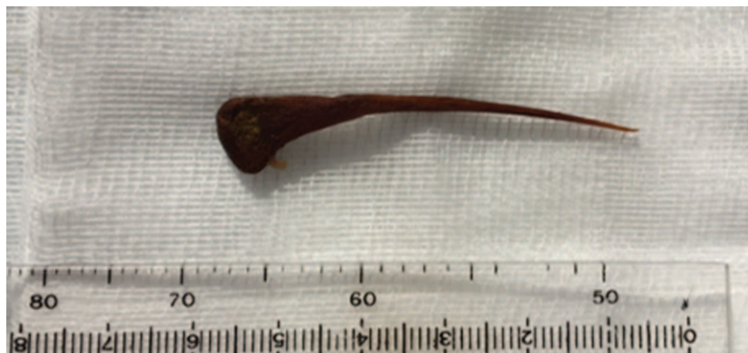
Figure 3. Extracted sharp chicken bone measures 5.5cm in length.

Had there been a clinical suspicion of a foreign body in the digestive tract, it might have been more appropriate to apply the