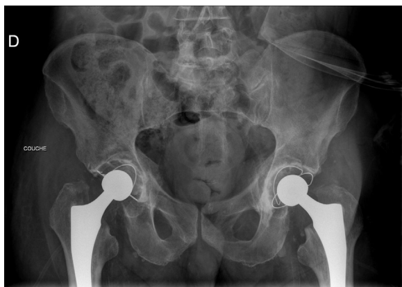
Figure 4. Anteroposterior pelvis post-operative pelvic radiographs demonstrating bilateral total hip arthroplasty.

Articular impaction of the medial roof or posterior wall, dislocation of the hip, comminuted posterior wall fractures, injury to the femoral head, and impaction of the acetabulum that involved more than 40% of the joint surface have all been associated with early failure after attempted reduction and internal fixation [8,17,18]. These radiological features have been correlated with a poor clinical outcome. Acute or delayed THA may be the most satisfactory option [17]. Benefits of THA must be balanced, however, against the