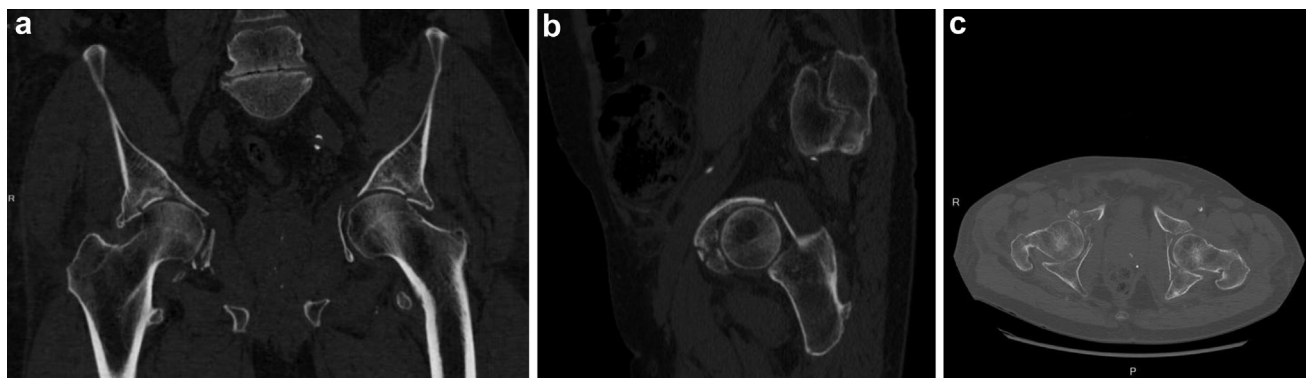
Figure 2. Pelvic computed tomography scan: coronal (a), sagittal (b), and axial (c) reconstructions on the right side of a fracture of the anterior and medial walls and an anterior column fracture with a minimal displacement and on the left side a fracture of both anterior and posterior column with a superior and medial displacement.

In elderly patients, most acetabular fractures are pathological due to osteoporotic bone. In the presence of osteoporosis, a simple fall or a seizure may result in a comminuted fracture.