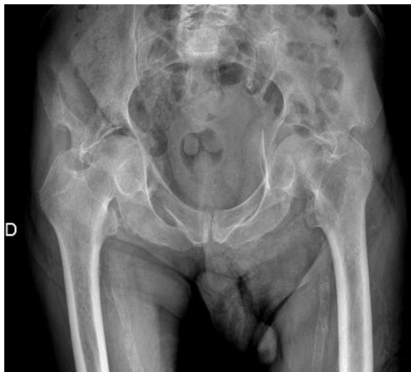
Figure 1. Anteroposterior pelvis radiograph showing bilateral acetabular fractures with subluxations of the femoral heads.

Ceraver, Roissy-en-France, France) was performed for the shoulder fracture dislocation by a deltopectoral approach, without any hemodynamic complications. During the post-operative period, passive shoulder mobilization started.