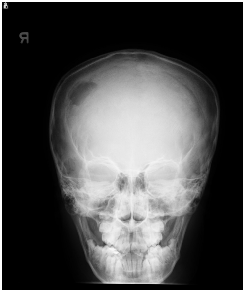
Figure 1. X-ray of the skull showing lytic lesion in the right parietal region.

craniotomy with gross total resection of the tumor, followed by cranioplasty was performed. Pathology report was consistent with SEF as before.