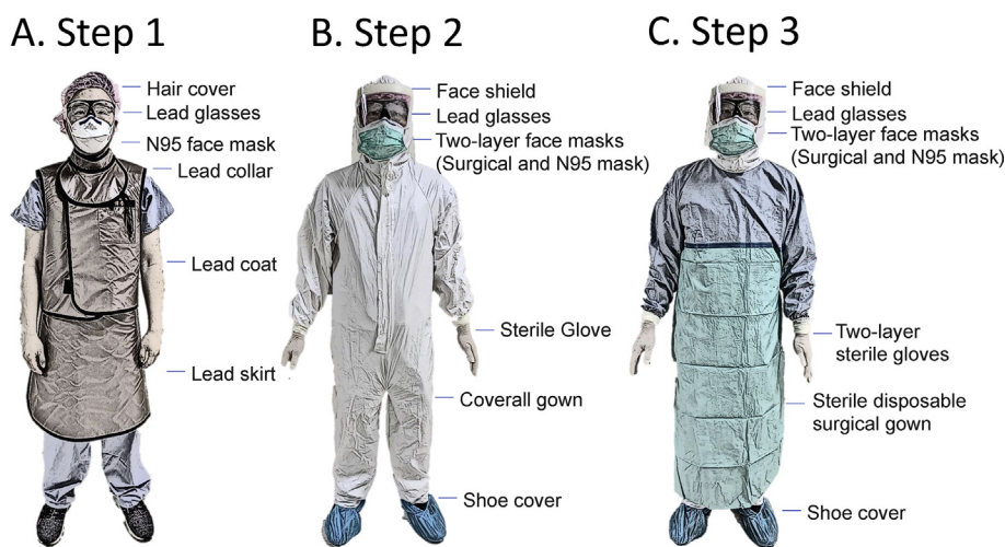
Figure 2 Personal protective equipment suggested in cardiac catheterization lab. The 3 steps were recommended for staffs to wear personal protective equipment in cardiac catheterization. Step 1: Hair cover, lead glasses, collar, coat and skirt were suggested as daily practice. N95 face mask should be worn at this step. Step 2: Face shield, shoe cover, sterile glove and coverall gown were suggested. Two-layer face masks should be worn with surgical on N95 face masks. Step 3: Disposable surgical gown and two-layer sterile gloves were suggested.

AMI: Acute myocardial infarction; COVID-19: coronavirus disease 2019; NSTEMI-ACS Non ST-segment elevation acute coronary syndrome; PCI: percutaneous coronary intervention; SARS-CoV-2: severe acute respiratory syndrome coronavirus 2; STEMI: ST-elevation myocardial infarction.