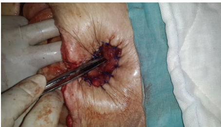
FIGURE 4: Performed ostomy by inverting skin is seen.

standard abdominal NPT; second one was performed on the newly created ostomy. Synchronized negative pressure was applied to both of NPTs (Figure 5) [9]. The second NPT on ostomy place was changed 3-4 times a day. Abdominal NPT was changed at 2-4 days' interval. Three days later, stoma maturation completed and second NPT application was stopped. Stoma bags could be applied.