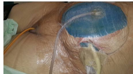
FIGURE 2: Glycerin-impregnated gauze ostomy opening, pesser drainage tube, and Flexi-Seal with applied abdominal NPT are seen.

into proximal opening of detached sigmoidostomy and pesser tube was inserted into distal opening. Glycerin-impregnated gauze was used around detached ostomy opening; pesser drainage tube and Flexi-Seal were also used to support segmentation of ostomy side from OA wound (Figure 2). Abdominal NPT was applied to OA. Low dose enteral nutrition was started at postoperative 1st day and increased day by day.