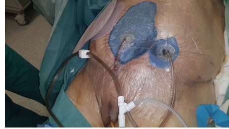
FIGURE 5: Two NPT are seen; one is abdominal NPT and second one is NPT applied on ostomy.

There are lots of different systems for controlling of EAF but controlling the fistula in frozen abdomen, especially deeply localized one, is very difficult [10]. Tube VAC technique can be used for this kind of patient. The EAFs were intubated using Malecot catheters of appropriate sizes,