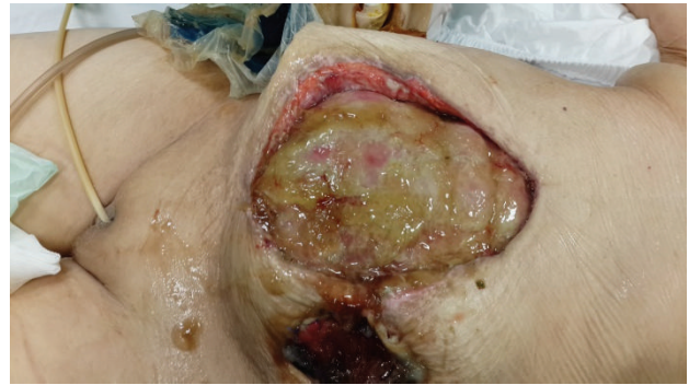
FIGURE 1: Edematous and fragile bowel with enteric fistula is seen in OA. Communication between ostomy opening and OA. Separation of ostomy from the skin and division of proximal and distal part of sigmoid colon after ostomy necrosis are seen.

At postoperative 15th day, ostomy necrosis was identified and the patient was consulted to our clinic. Her general condition, consciousness, and orientation were not well. She was mechanically ventilated. Her vital parameters were BP: 85/50 mmHg, HR: 120, RR: 28, F: 38°C, and intra-abdominal pressure (IAP): 14 mmHg. She was in septic shock and mild acidosis (Table 1). SOFA score of the patient was 12 and estimated mortality was 50% accordingly. She underwent emergent reoperation. Necrosis all around the ostomy and complete collapse with mucocutaneous detachment of ostomy were seen. Connection was present between the ostomy opening and midline incision with severe fasciitis and fecal peritonitis. Detached proximal and distal sigmoidostomy openings were seen in abdomen deeply (Figure 1). According to new modified Björck classification OA score of the patient was 4 [8]. All intra-abdominal content was irrigated with saline. Since bowel was very edematous and fragile with severe adhesion and short mesentery, these openings of ostomies could not be mobilized. New proximal end transvers colostomy was opened on right side hardly. To redirect colonic effluent to outside, Flexi-Seal was inserted