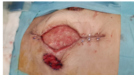
FIGURE 6: After source control was achieved, good granulation occurred and started to close step by step.