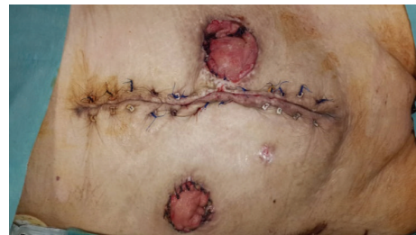
FIGURE 7: Completed closure is seen.

while the surface of the OA was covered by petroleum-impregnated gauzes and on top by a polyurethane sponge, through which the Malecot catheters were removed [11]. The Flexi-Seal device offers another alternative for effluent control. It is useful regardless of whether the enteric fistulas are low or high output and can even be useful in patients not on bowel rest. Hardwicke showed the successful continent diversion of gastrointestinal secretions in patients with EAF by the Flexi-Seal [12]. Salgado et al. reported that the Flexi-Seal device serves as a valuable tool in aiding in effluent control in complex abdominal wall reconstruction in patients presenting with EAF [13]. Our EAF controlling system was similar to this system in some aspects. In our case, enteric effluent was removed from OA wound by using Flexi-Seal in deeply localized fistula in conjunction with NPT. This procedure may gain time to patient as well as to surgeon until adequate source control could be achieved. Three days after this operation, intra-abdominal sepsis and edema were resolved and these freely located intra-abdominal two colonic ends could be converted into one ostomy.