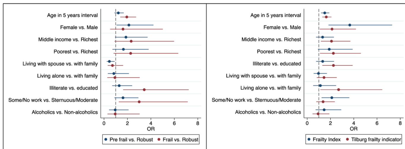
Panel – 3a