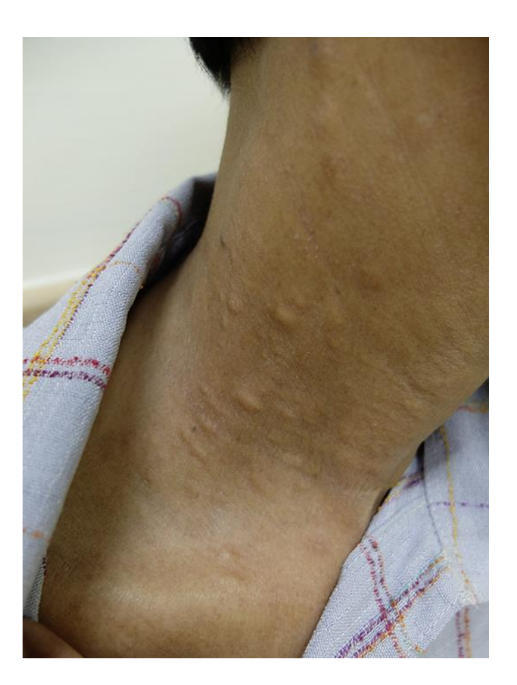
Fig. 1. Multiple skin-colored papules and plaques on the neck.