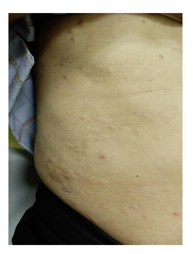
Fig. 2. Multiple skin-colored papules and plaques on the abdominal wall.