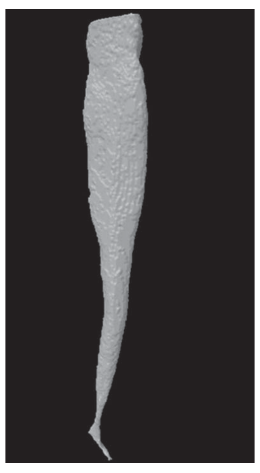
Figure 4- Image of a 3D model of the root canal after automatic segmentation