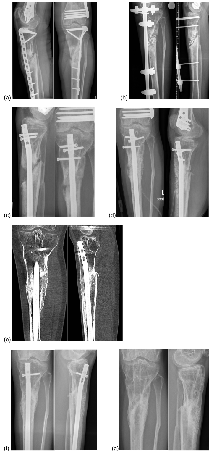
Figure 3. Bioactive glass in combination with autologous bone graft in a patient with an infected non-union of the proximal tibia. (a) Infected non-union of the proximal tibia and plate osteosynthesis. (b) After debridement with removal of the internal osteosynthesis, resection of the infected bone and implantation of a PMMA chain. (c) Re-osteosynthesis with an intramedullary nail after control of infection. (d) Defect filling with a combination of bioactive glass S53P4 and autologous bone graft. (e) Twelve months after defect filling. (f) Two years after defect filling: bony fusion. (g) Final result. Abbreviations: AB: autologous bone graft; BAG: bioactive glass; PMMA: polymethylmethacrylate; VEGF: vascular endothelial growth factor.