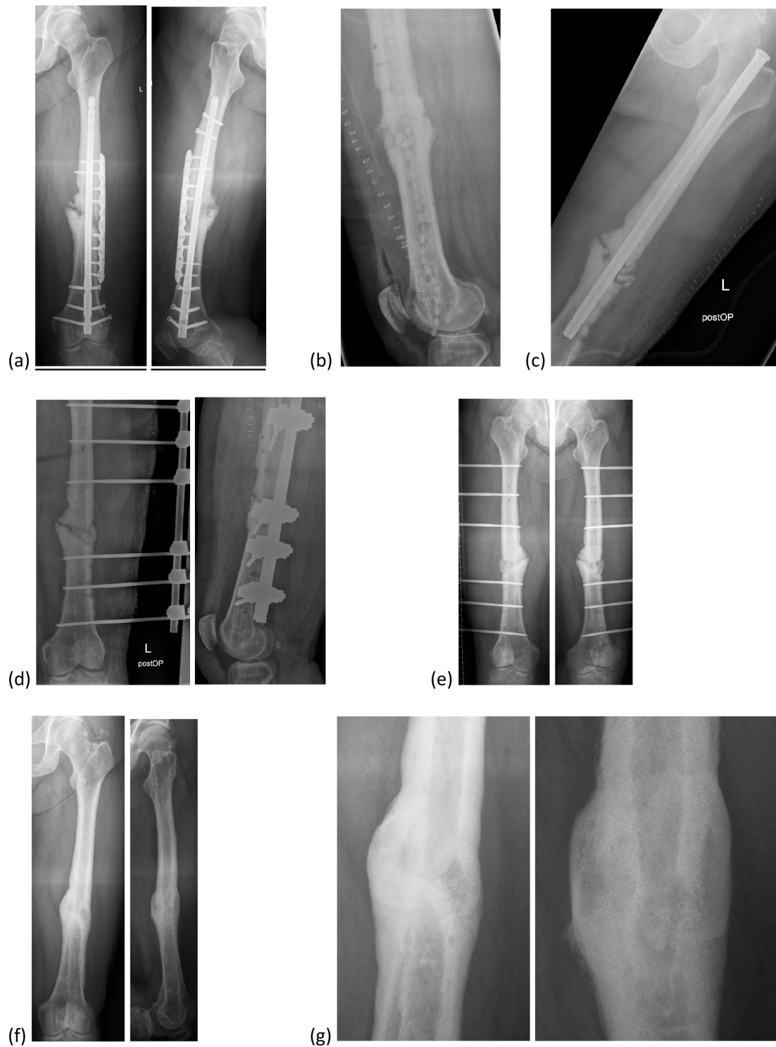
Figure 2. Bioactive glass in a patient with an infected non-union of the femur. (a) Infected non-union of the femur with loosened retrograde intramedullary nail and plate osteosynthesis. (b) After debridement with removal of the internal osteosynthesis, reaming of the intramedullary canal and insertion of a PMMA chain. (c) Temporary stabilization with an antegrade intramedullary nail. (d) Defect filling with bioactive glass after control of infection; definitive stabilization with external fixator. (e) Six months after defect filling. (f) Final result with bony fusion after 2 years. (g) Image enlargement of (f) .