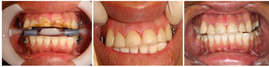
Figure 1 Teeth with severe fluorosis treated with direct resin aesthetic veneers (baseline, after treatment, and follow-up).

Table 2 depicts the prevalence changes observed between baseline and follow-up, highlighting the migration of participants from “no impact” conditions (sometimes, rarely, or never) to “with impact” (always or often) conditions. Of the 15 participants who had an impact at baseline, 11 had no impact after the aesthetic restorative treatment ( p = 0.006 ). Considering the prevalence of functional and psychosocial impact according to the OHIP-14 dimensions, there was a significant reduction in the prevalence of impact on the psychological discomfort