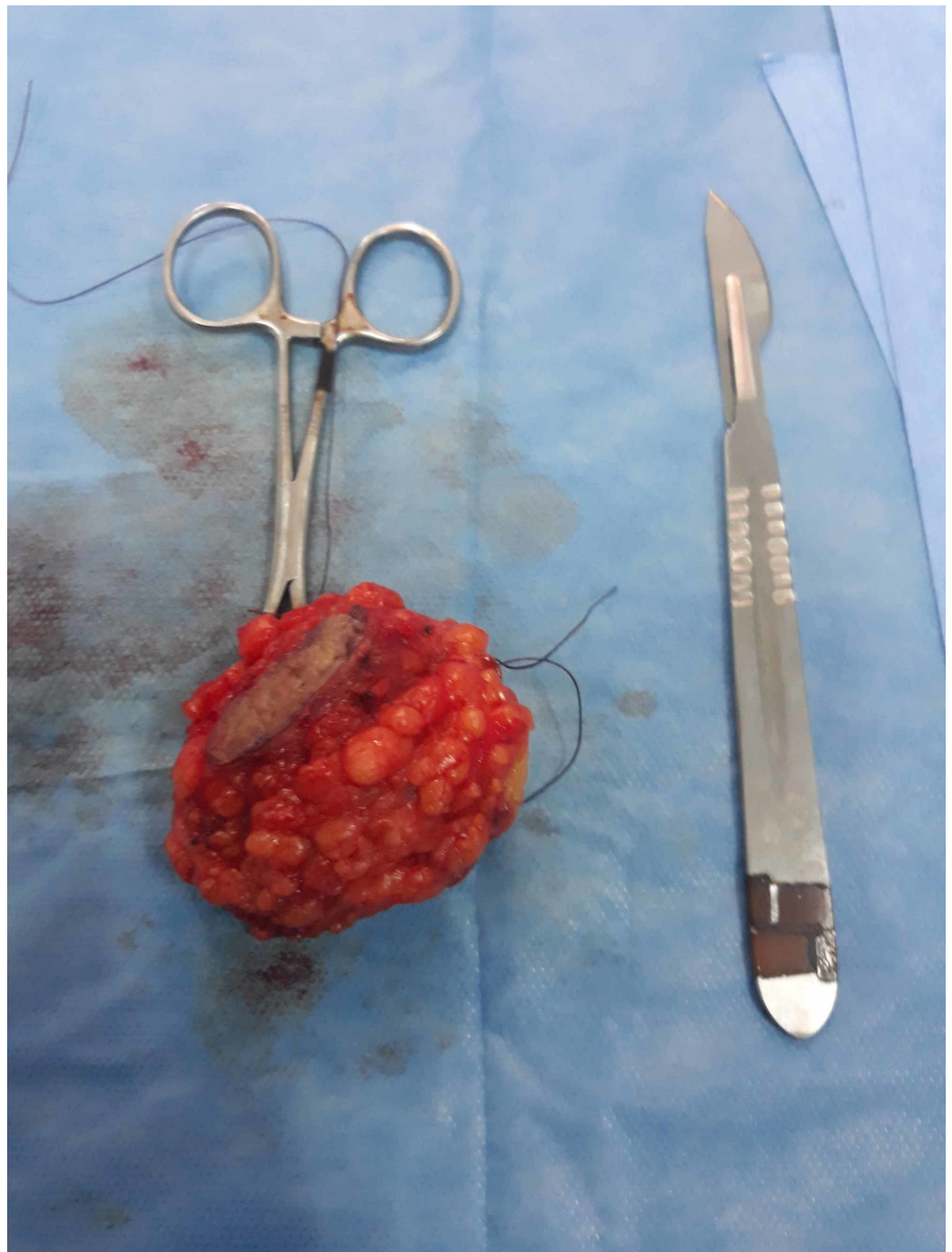
FIGURE 3: Image showing the resected mass