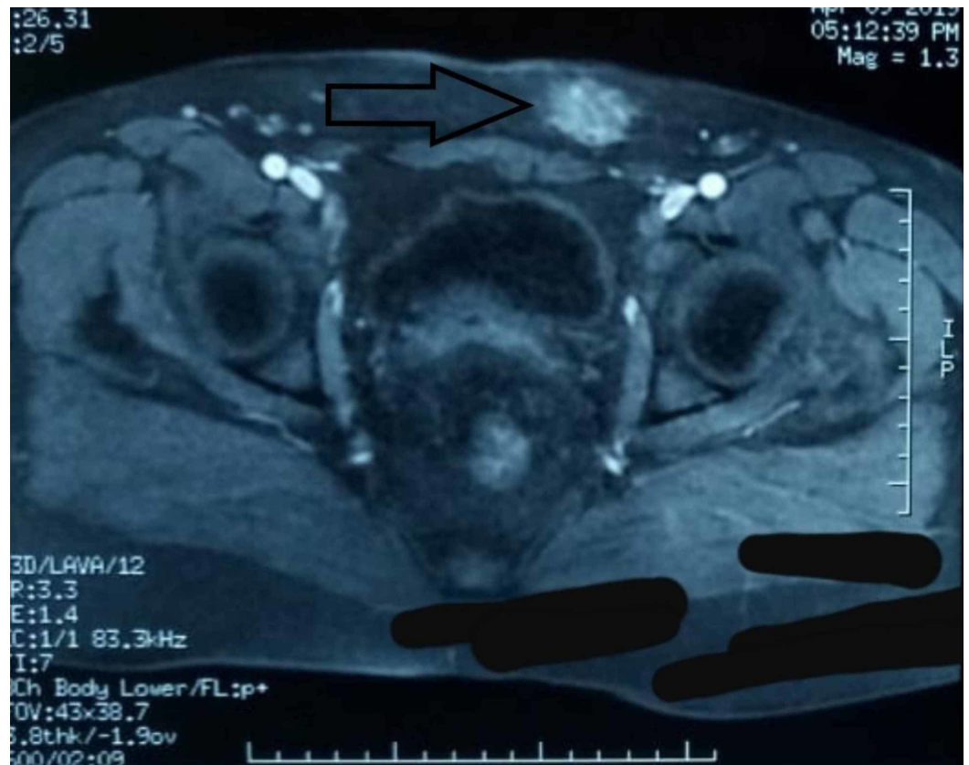
FIGURE 2: Pelvic magnetic resonance imaging (MRI) scan showing a mass (black arrow) of the left lateral pelvic wall

Under general anesthesia, surgical exploration revealed a mass at the left lower rectus wall, and en bloc excision of the mass was performed (Figure 3). Anatomopathology confirmed the presence of benign fibrous tissue with multiple endometrial glands and stroma, confirming the diagnosis of endometriosis. The patient was seen at regular intervals, and she was symptom-free at the six-month follow-up review.