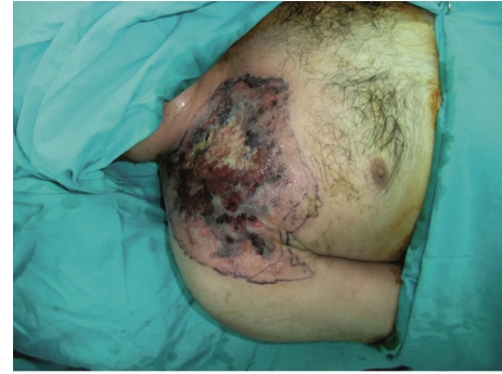
FIGURE 1: Photograph of the patient showing the signs of necrotizing fasciitis, including necrosis, edema, erythema, and induration on the skin.

The purpose of this paper is to draw the attention of medical staff to the important effects of extravasation injury especially in immune-compromised patients. We suggest an