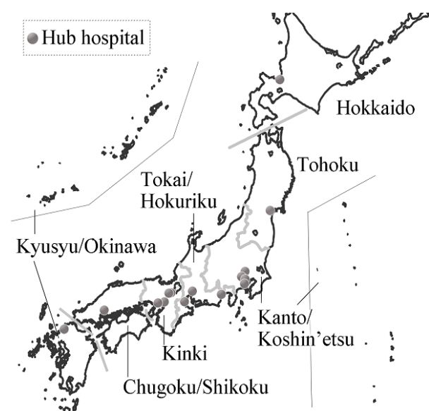
Figure 1. Seven Regional Blocks and Childhood Cancer Hub Hospitals in Japan

To investigate travel times and distances, we required information on destinations and origins. In this context, destinations were defined as the addresses of the 15 aforementioned childhood cancer hub hospitals, as of