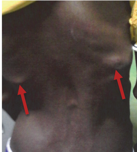
FIGURE 1: Bilateral back swelling (red arrows) with dextroconvex scoliotic lumbar attitude.