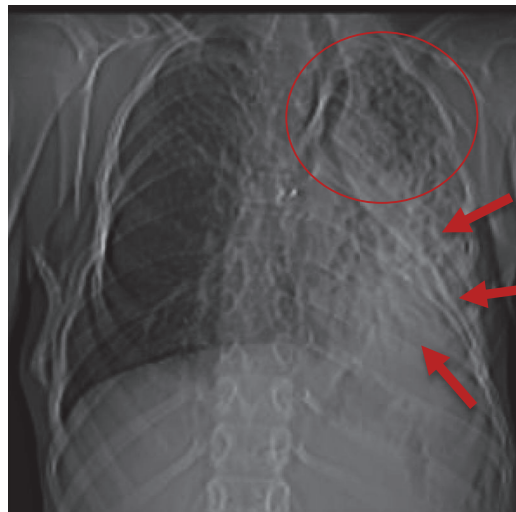
FIGURE 2: Frontal chest x-ray showing an atelectasis of the left lower lobe (red circle) with alvéolo-interstitial pneumopathy on the homolateral upper lobe (red arrows).