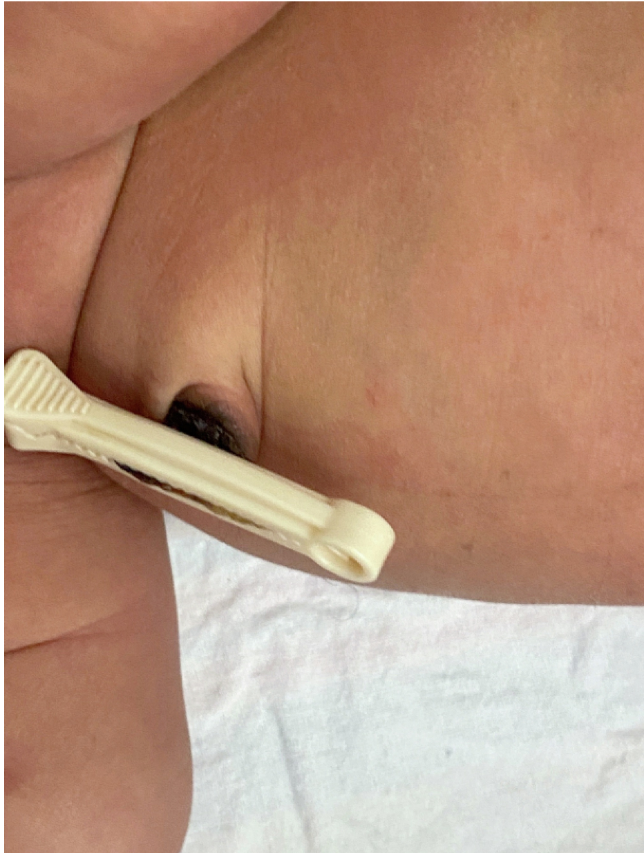
FIGURE 4: Umbilical cord after 36 hours of birth