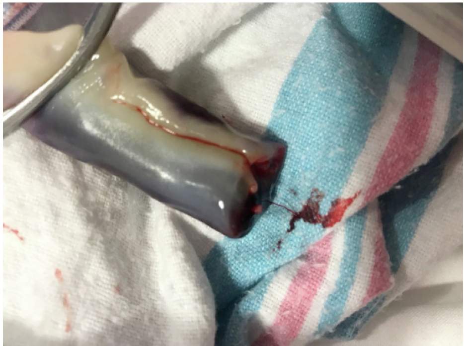
FIGURE 2: Umbilical cord hematoma soon after birth