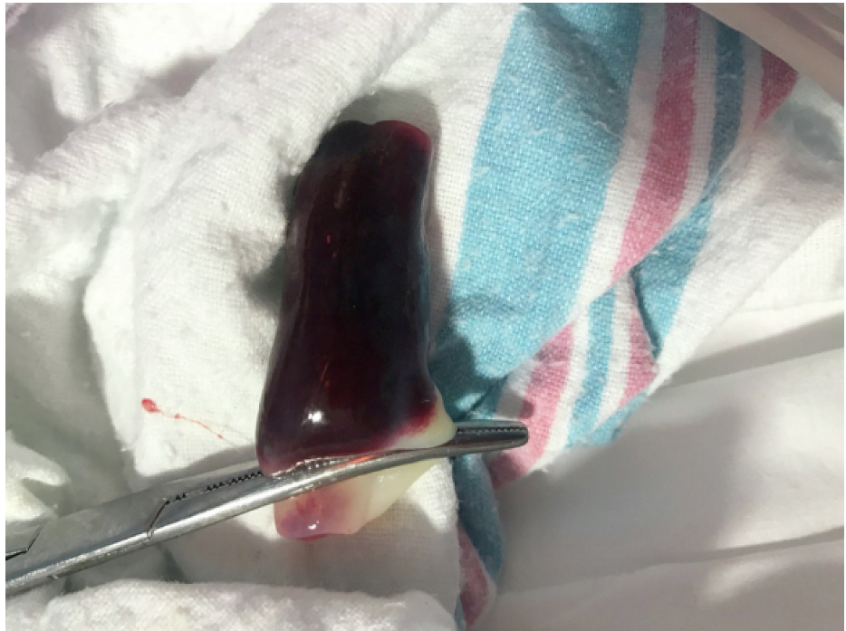
FIGURE 1: Umbilical cord hematoma soon after birth

measuring 4x5 cm (Figure 3). The heart rate was regular and no murmur was audible. There was no active bleeding, hematoma, or bruise from any other side.