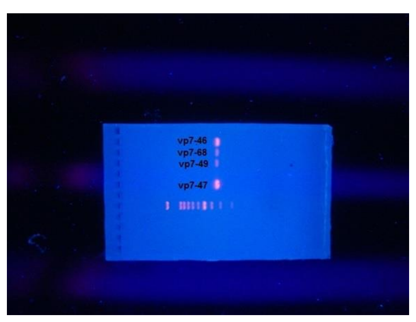
Figure 2 : It adds background and an idea of the circulated rotavirus strain in Sudan so, it will help to make a decision of distribute the vaccine in Sudan