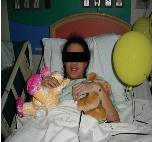
FIGURE 1: Dysmorphic facial features: high prominent forehead, long nose with a broad bridge, mild micrognathia, and short palpebral fissures.