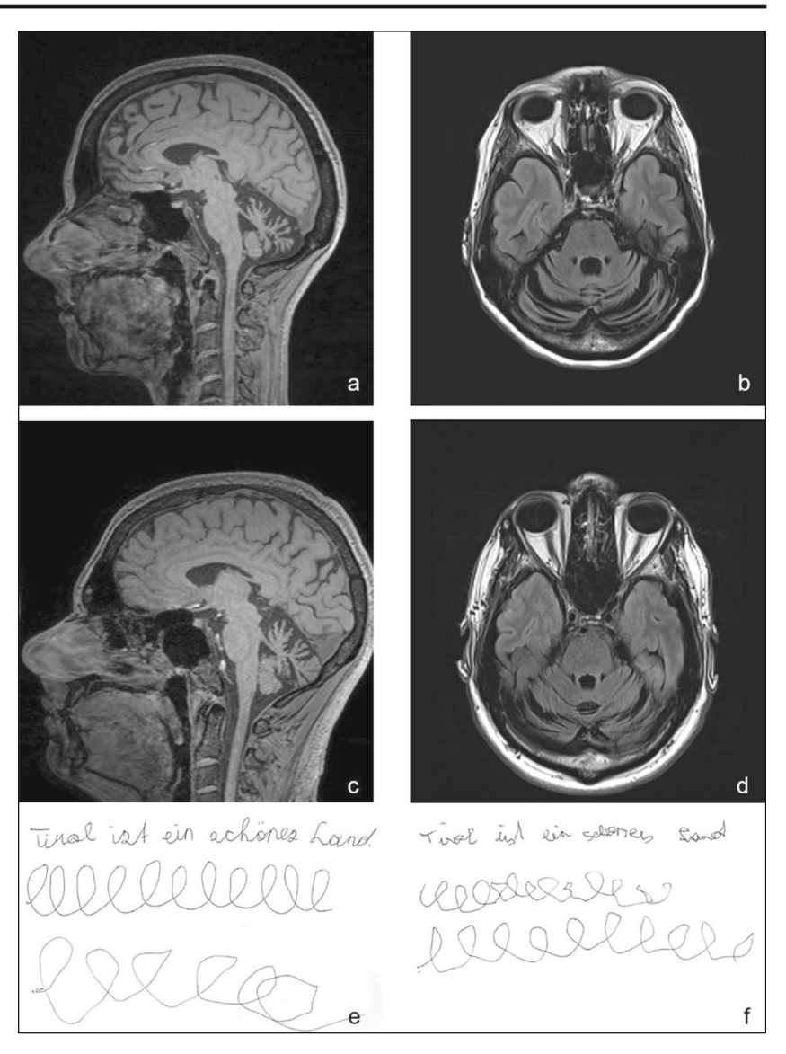
Fig. 1 Sagittal and axial MRI imaging demonstrating cerebellar atrophy in the index patient (a and b) and patient III-3 (c and d). Writing samples depicting writer's cramp associated dysgraphia (full sentence and first L-letter series written with dominant hand, second L-letter series drawn with non-dominant hand) in the index patient (e) and patient III-3 (f)

were unremarkable. Initial SARA score was 10 points and remained stable over follow-up. Evoked potentials, nerve conduction studies and laboratory parameters were within normal limits.