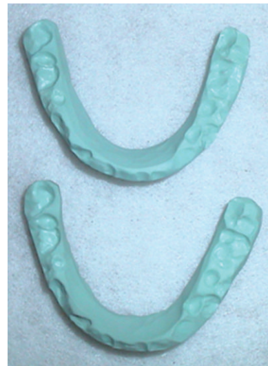
FIGURE 1: Custom-made intraoral appliance used for holistic temporomandibular therapy.

*Data are presented as mean ± SD (range).