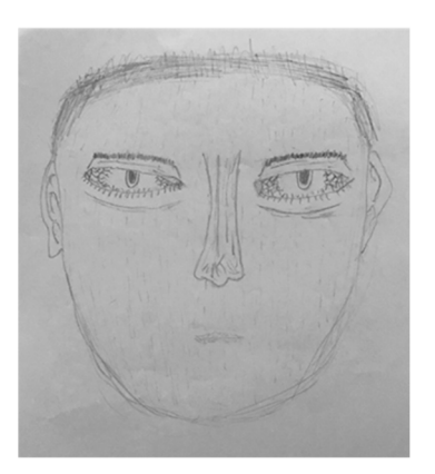
Figure 4. The drawing of a 16-year-old male participant who reported experiencing CPA. The significant drawing indicators included the emphasized or hair standing up, the emphasized or double ears, and the emphasized or double face line.

Interestingly, as can be seen in Figure 4, the current study found the significant indicators for CPA that are in accordance with the research by Lev-Wiesel et al. [63] in the following indicators: the emphasized or hair standing up (signifying insecurity, helplessness, fear, and anxiety), the emphasized or double ears (symbolizing the ability to receive and deal with the external world) [64,65], and the emphasized hands and arms (indicating helplessness and anxiety in dealing and interacting with the environment or the external world) [67]. The emphasized hair could also act as an indicator to the frontal lobe, suggesting the unconscious feelings of the uncontrolled impulsivity [64,70] or the brain injury as a result of the violence inflicted [71]. In this study, it was found that the emphasized or double face line was significant for the CPA group as well.