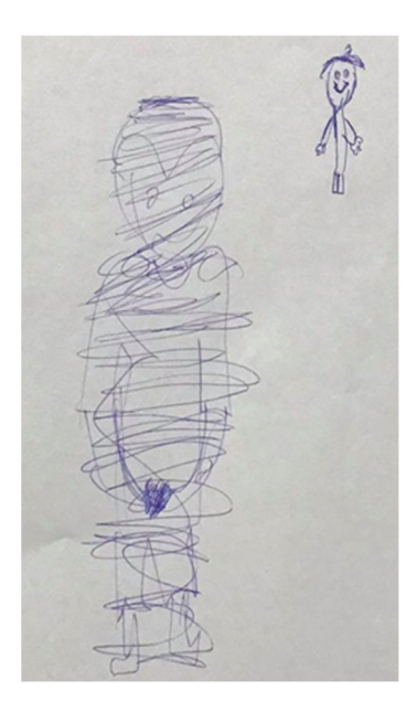
Figure 3. The drawing of a 16-year-old male participant who reported experiencing CSA. The significant drawing indicators included the presence of genitals and the emphasized face line.

hollow, crossed, omitted), and hands and arms (clinging, detached, shadowed, omitted, cutoff) [69].