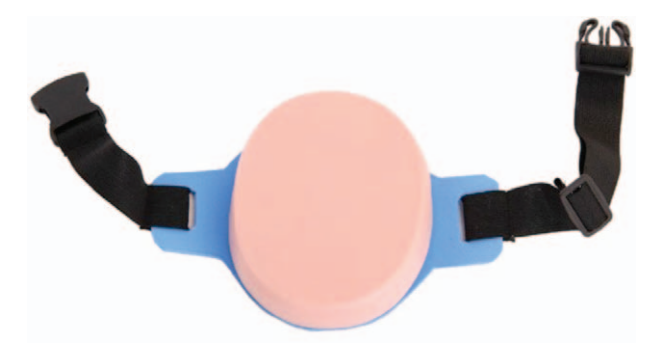
Figure 6. The small device designed by some company.

The results showed that the time spent on simple teaching, detailed teaching, and mastery stage in the intervention group were less than those in the control group. This proves that