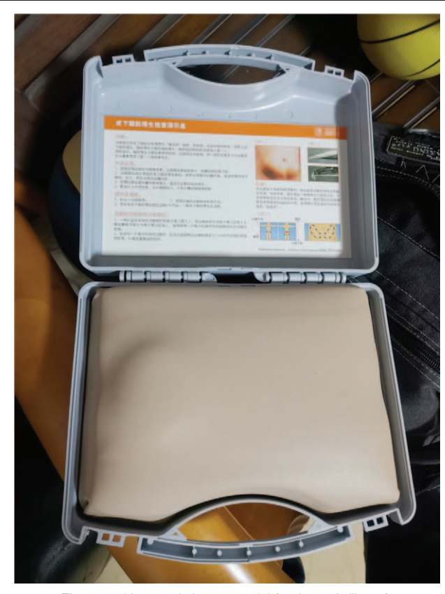
Figure 5. Human abdomen model (1 piece of silicone).

busy schedule of the nurses, they do not have enough time to train patients, and consequently patients have few opportunities to repeat insulin injections.<sup>[13]</sup>