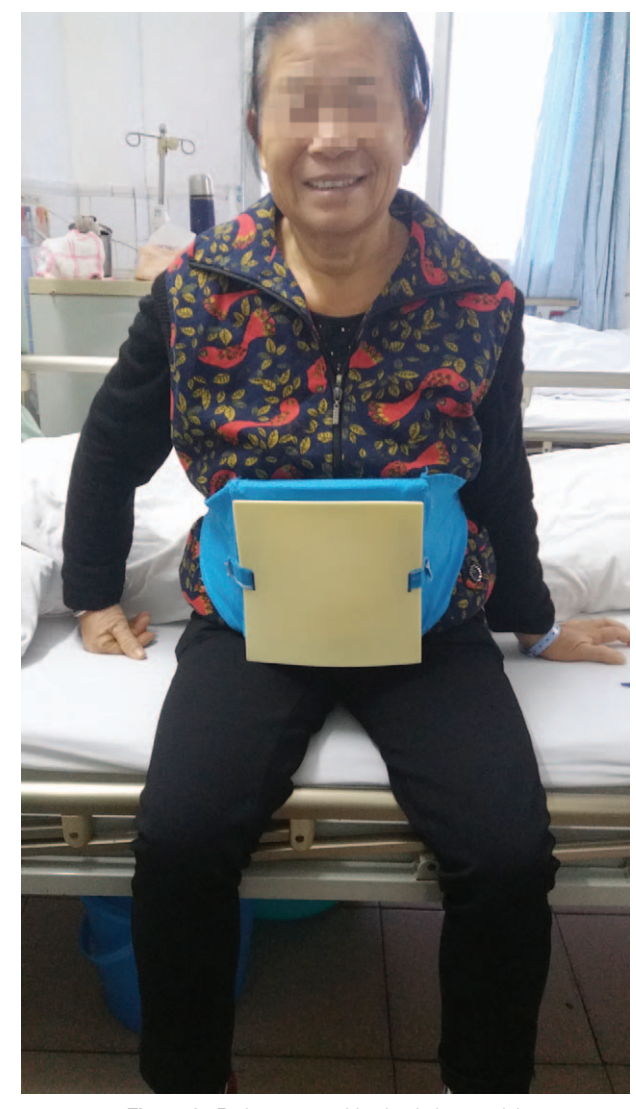
Figure 3. Patient wears this simulation model.

The patients were required to repeat the procedure until they were proficient.