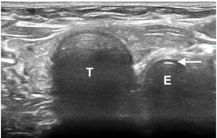
Figure 2. Esophageal intubation imaged with the static technique. T , trachea; E , esophagus; white arrow, endotracheal tube.

t-test to analyze the relationships between the ultrasound static and dynamic techniques with respect to the accuracy of correctly identifying location of intubation, operator time to identification, and operator confidence. In addition, we included moderating variables such as operators, cadaver number, and actual location of the intubations in the analysis.