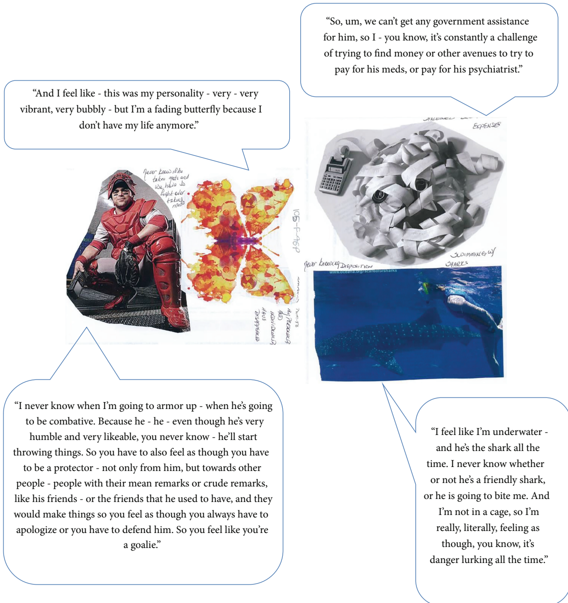
FIGURE 3: Caregiver ID: 105-F-46-P.

caregivers also spoke about the positive aspects of their role. The most commonly reported benefit was the love that the caregiver shared with the person with schizophrenia ( n = 9 ): “Right. And then I have a heart because I love her. And I probably love her even more now.” (104-F-48-D).