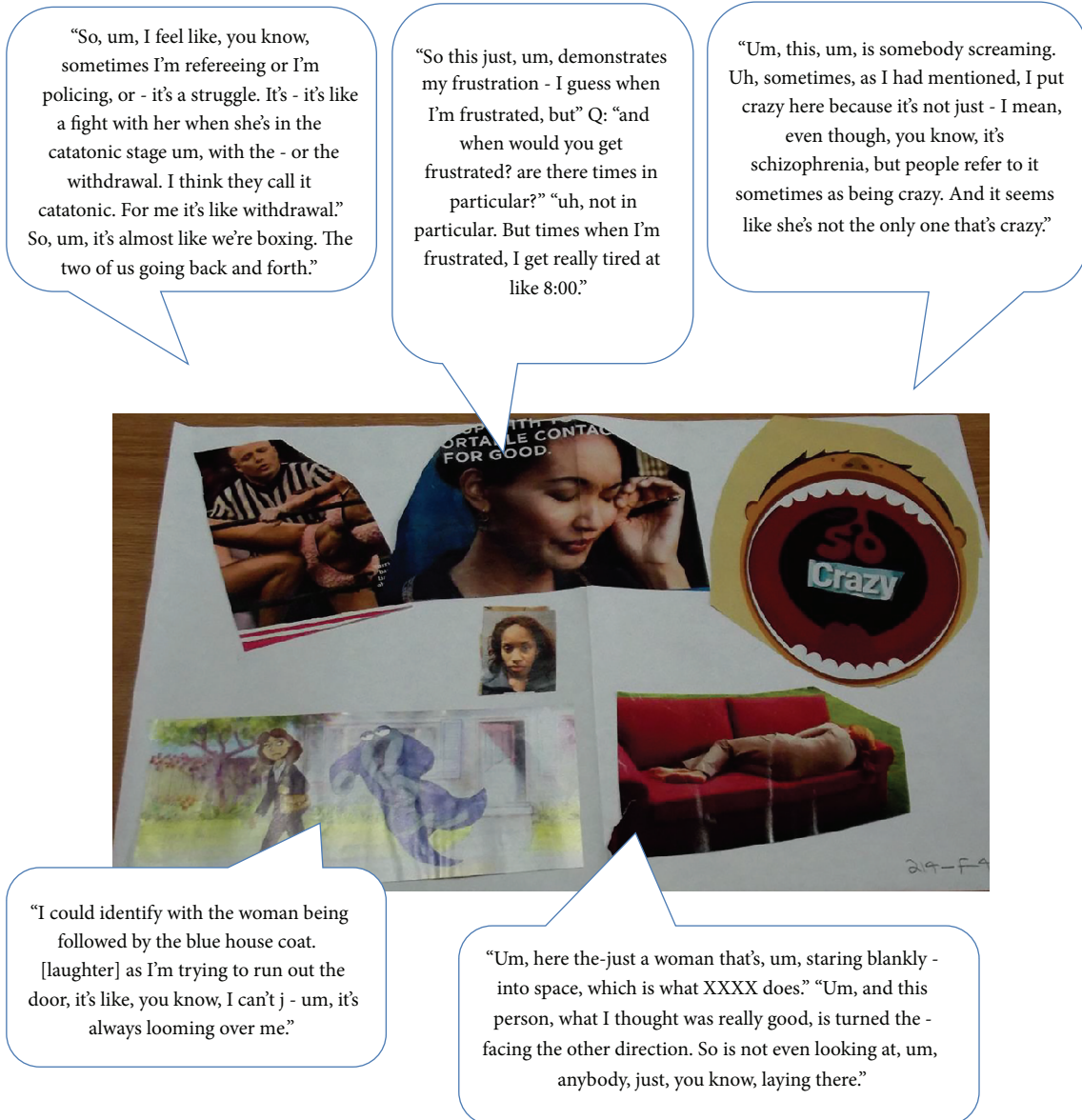
FIGURE 1: Caregiver ID: 214-F-48-C.

included their caregiving responsibilities into the enabling exercise, such as ensuring the person with schizophrenia took their medicine ( n = 9 ) and having to take them to the doctors ( n = 2 ).