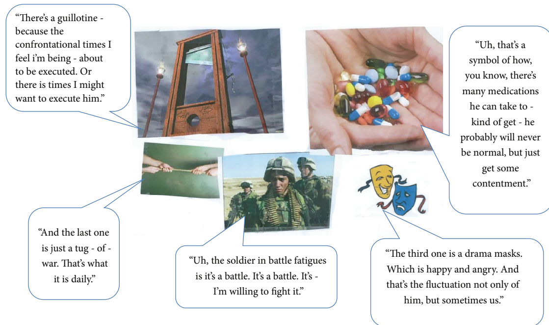
FIGURE 2: Caregiver ID: 102-M-40-C.

she wouldn't be able to continue caring for the person with schizophrenia for much longer.