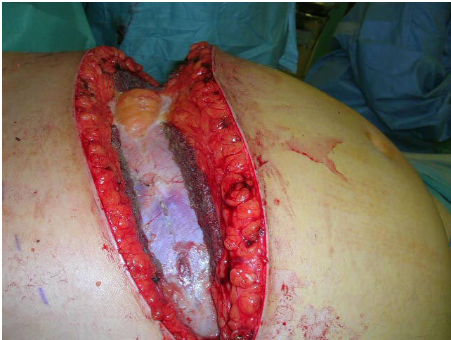
Figure 2 Transverse laparotomy incision. Seen from the patient's right side, a bilateral subcostal incision is being performed with posterior fascia still intact.

ascites (about 2 liters). Simultaneously without changing the ventilator set up, the tidal volume increased from 400 to 500 ml, and the mean arterial pressure about 10 mmHg. The abdomen or peripancreatic area were not explored further (Fig. 3) and the viscera were covered with a negative pressure dressing. Back at the SICU a renal replacement therapy was started.