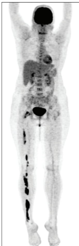
Figure 2: Whole body F-18 FDG PET/CT showing intense tracer uptake in the right femur and tibia. Mild degenerative heterogeneity in vertebra and sacrum noted.