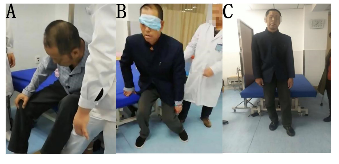
FIGURE 3 | (A) Before treatment, (B) during treatment, (C) after treatment.

the input of right-sided visuospatial sensory information and promotes the balance of spatial perception on both sides, thus, reducing the excitability of the corresponding brain areas in the left hemisphere and the tendency to pay attention to the right side. This also reduces the excitability of the posterior parietal and motor cortical connections in the left hemisphere, therefore, improving the "pushing phenomenon" and corresponding motor functions in PS patients.