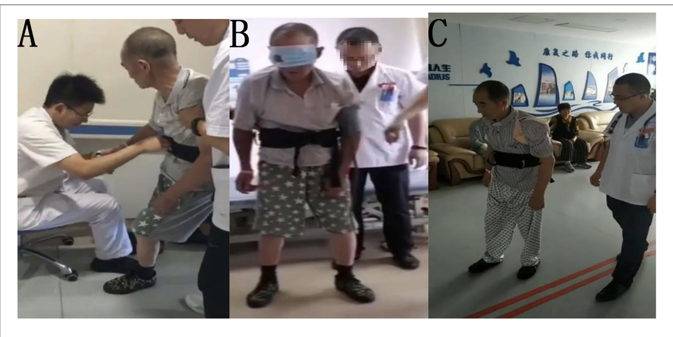
FIGURE 2 | (A) Before treatment, (B) during treatment, (C) after treatment.