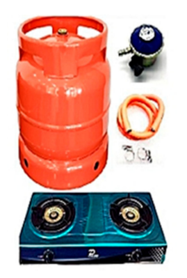
Figure 1. Stove, cylinder, hose, and regulator.

LPG stoves and cylinders were installed inside the home of the pregnant women, in a position of her choice, usually in an elevated position near a window (if possible) for ventilation. The stoves were locally made and available in the markets of the study site. They were small two burner stoves and were selected due to their low cost and availability in the area, they met the quality control of the national standard and testing institute and cost USD$13 (Figure 1). Cylinder size was 12 kg, the cost per cylinder with gas was USD32 (Cylinder deposit was USD16, and LPG USD16).