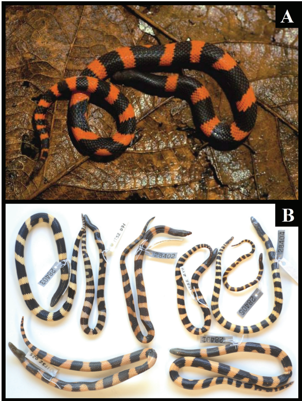
Figure 3. Coloration in Geophis lorancai : A adult male paratype (MZFC 28402); and B type series.

to level of suture between 2 nd and 3 rd supralabials; posterior fourth of maxilla curved ventrally in lateral view; anterior tip of maxilla toothless, bluntly pointed; maxillary teeth 7, recurved; teeth slightly longer at middle of maxilla; large flange projecting