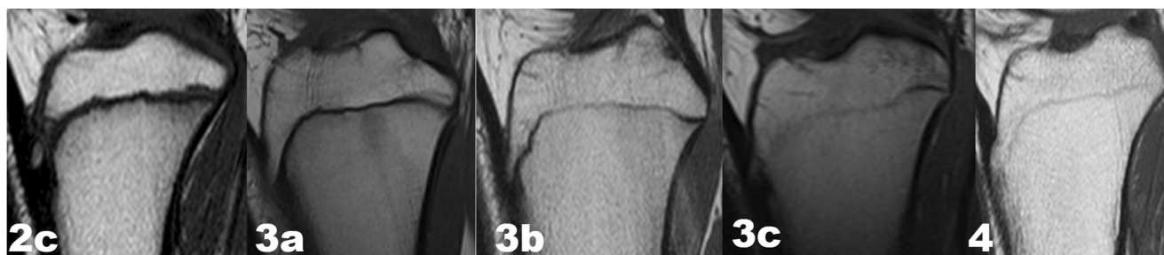
Fig. 2 T1-weighted turbo spin echo (T1-TSE) sequences in the sagittal plane on MRI images: stages 2c,3a,3b,3c and 4 according to combined scoring system described by Schmeling et al. [21] and Kellinghaus et al. [22] for proximal tibial epiphysis

Estimation of the ossification stage of both epiphyses was possible in our sample. Figures 1 and 2 show the MRI findings for ossification stages 2c, 3a, 3b, 3c, and 4 that were observed for both epiphyses. The remaining ossification stages were not found within the study population.