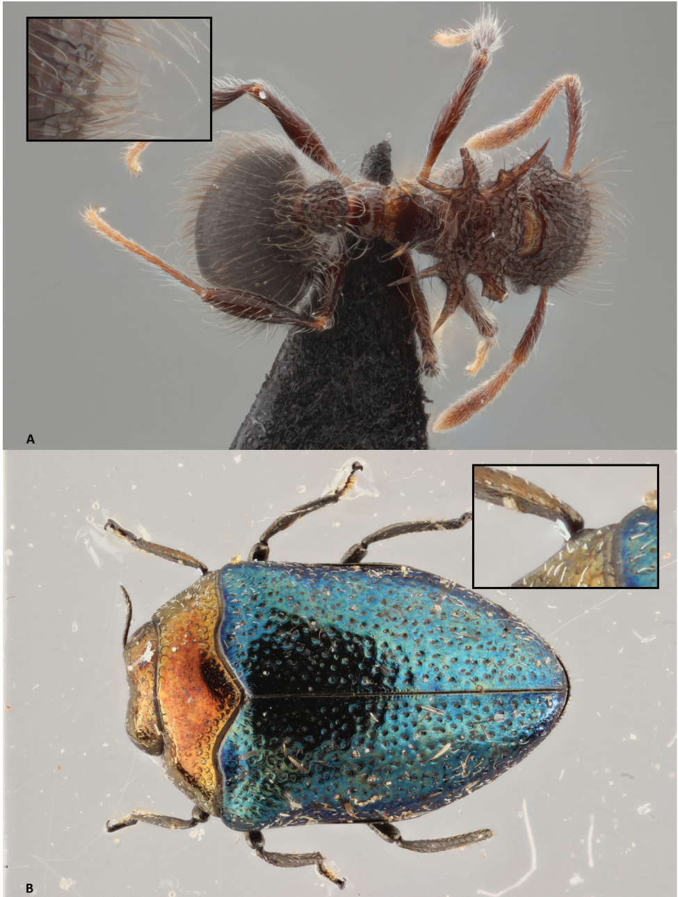
Figure 8. Focus stacking in Zerene Stacker. The small image in the upper corner provides a detailed close-up of 518 \times 345 pix of the image at 100%. A Stack of 74 pictures, aligned and combined with PMax B Stack of 41 pictures, aligned and combined with PMax. The individual pictures of both stacks are made with the Canon-Cognisys set-up and double flash lights.