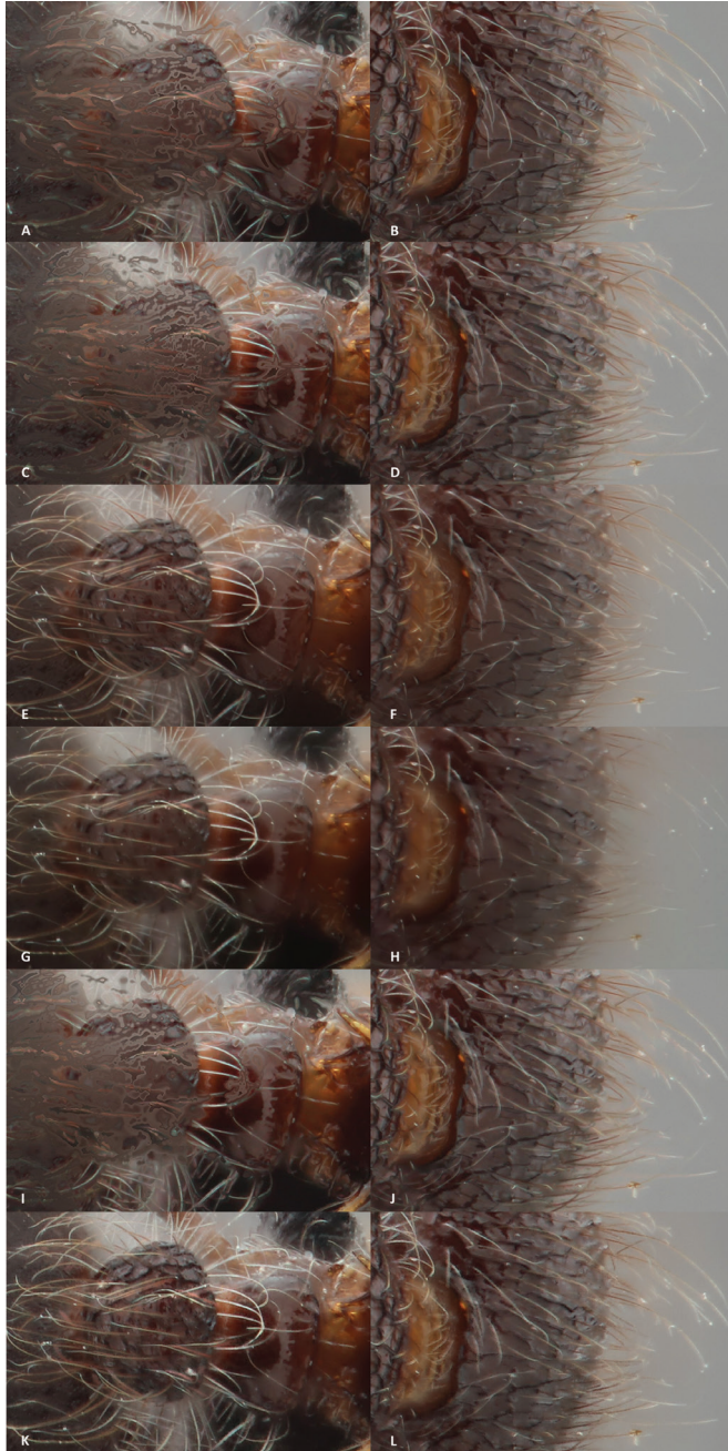
Figure 3. The results of the different stacking methods in CombineZP: each stacking option is provided with a detail of a hairy leg and a part of the head with hairs. A, B details of the stack pictures by the Do Stack method C, D details of the stacked picture with the Do Soft Stack E, F details of the Do Weighted Stack method G, H details of the combined pictured with the Pyramid Weighted method I, J details of the stacked image with the Pyramid Do stack method K, L Details of the Stacked image with the Pyramid Maximum Contrast method.