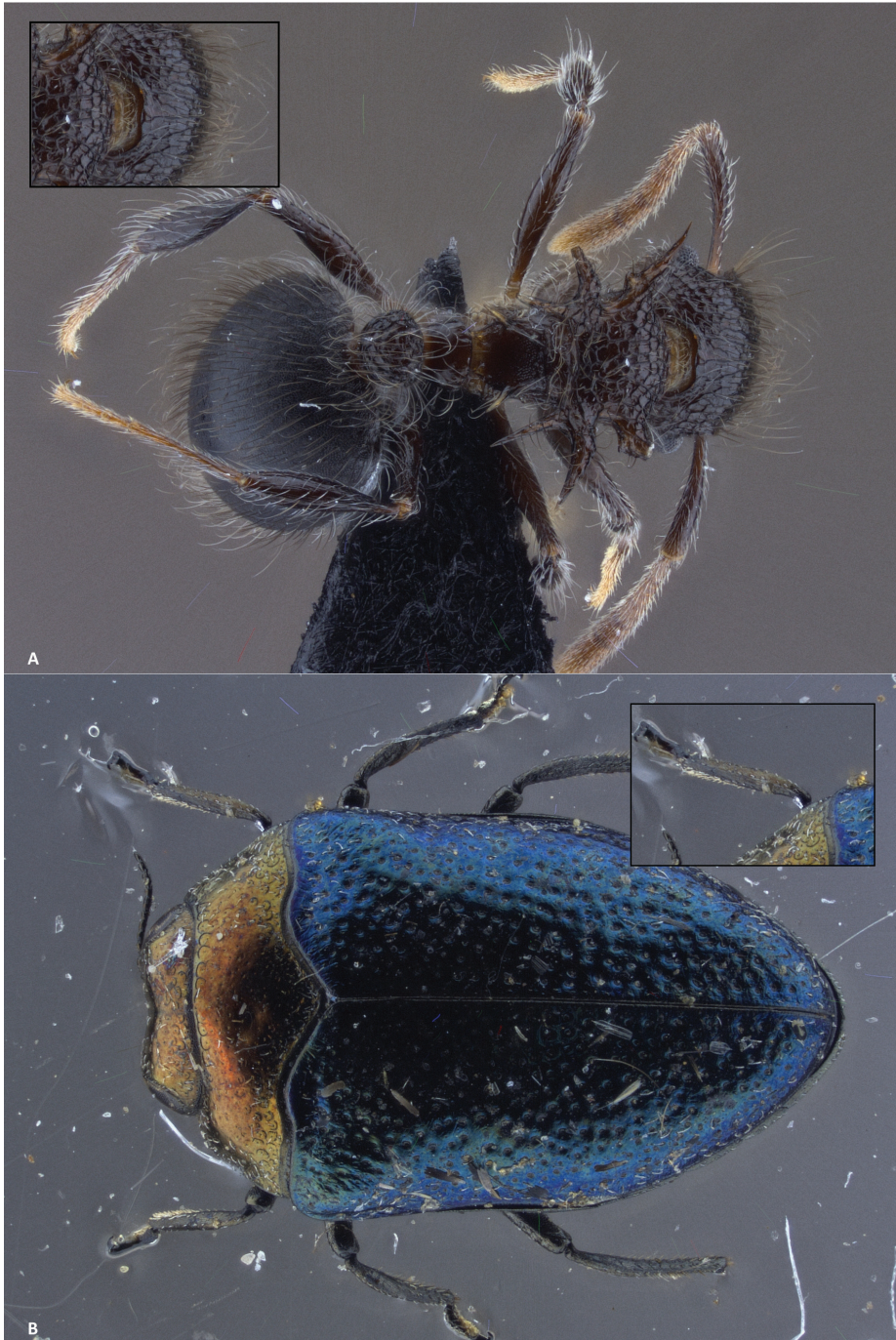
Figure 7. Focus stacking in Zerene Stacker. The small image in the upper corner provides a detailed close-up of 518 \times 345 pix of the image at 100%. A Stack of 77 pictures, aligned and combined with PMax B Stack of 44 pictures, aligned and combined with PMax The individual pictures of both stacks are made with the Leica Z6 APO with DFC290 and Manfrotto led light system.