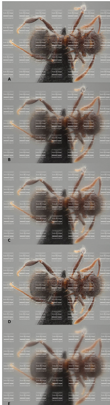
Figure 2. The results of the different stacking methods in Auto-Montage: each stacking option is provided with a single picture which is reduced in size by the Auto-Montage software itself and imprinted with watermarks. A represents the Blended Stacking option B picture composed by the Compound Weighted method C picture stacked by the Exponentially Weighted option D picture composed by the Fixed method and E picture stacked by the Weighted method.