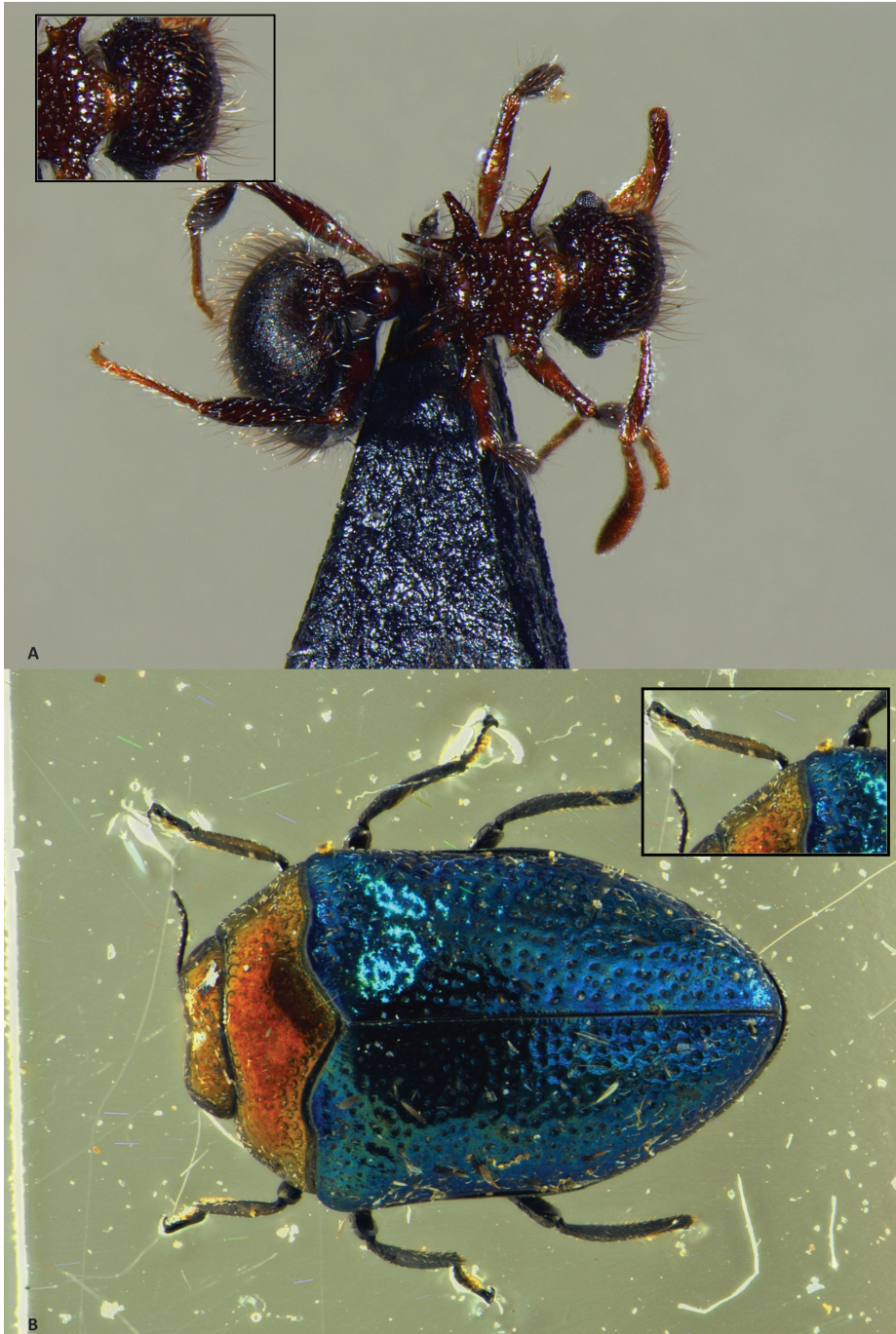
Figure 6. Focus stacking in Zerene Stacker. The small image in the upper corner provides a detailed close-up of 518 \times 345 pix of the image at 100%. A Stack of 70 pictures, aligned and combined with PMax B Stack of 41 pictures, aligned and combined with PMax. The individual pictures of both stacks are made with the Leica MZ16A with DFC500 camera and Leica KL 1500 LCD lights.