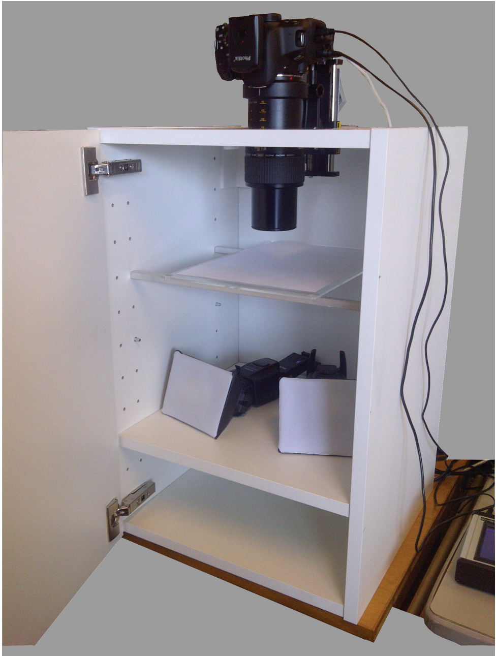
Figure 1. The Canon-Cognisys set-up at the RBINS. The Canon 600D Camera, equipped with a Canon MP-E 65 mm 1:2.8 1–5× Macro Photo Lens, is mounted on the vertically positioned StackShot (Cognisys inc.). In the Ikea closet, at the bottom, you see the two Yongnuo YN560-II speedlites positioned frontally and above is the plexiglas plate covered with paper to position the specimen.