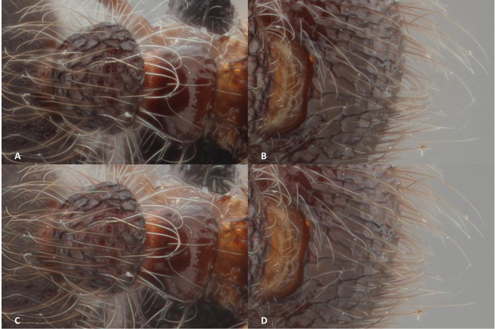
Figure 5. The results of the different stacking methods in Zerene Stacker, each with a detail of a hairy leg and a part of the head with hairs. A, B details of the stack pictures by the PMax method C, D details of the stacked picture with the DMap method.

B) produces a composed picture with a few halos around the abdominal hairs, but this method creates a lighter edge around the entire specimen. On another background this may work, but here it further distorts the image rather than accentuating it. The 'Depth' method (Method B, Figures 4C, D) is not suited for these types of specimens as the hairs produce halos all over the specimen. However, this can be controlled by adjusting the radius when choosing the depth method. We didn't manage to find a set of parameters that gave a better result on this particular specimen. However, a specimen with less fine details, such as the beetle, would be fine with this method.