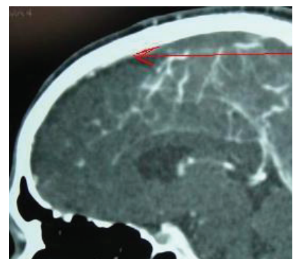
Figure 1. Venous sinus thrombosis along superior sagittal sinus and transverse sinuses with secondary hemorrhagic infarction more on the left side

29 year old Indian presented with sever headache and vomiting of one day duration, the headache was sever not associated with fever, the second day the patient had paralysis of the right side of the body, there were no fever, diplopia, incontinence. On examination was fully conscious oriented with right side upper motor neuron facial palsy with flaccid upper and lower limb with power of grade one and bilateral papilledema. His computed tomography with angiography, revealed venous sinus thrombosis along superior sagittal sinus and transverse sinuses with secondary hemorrhagic infarction more on the left side (Figure 1). His