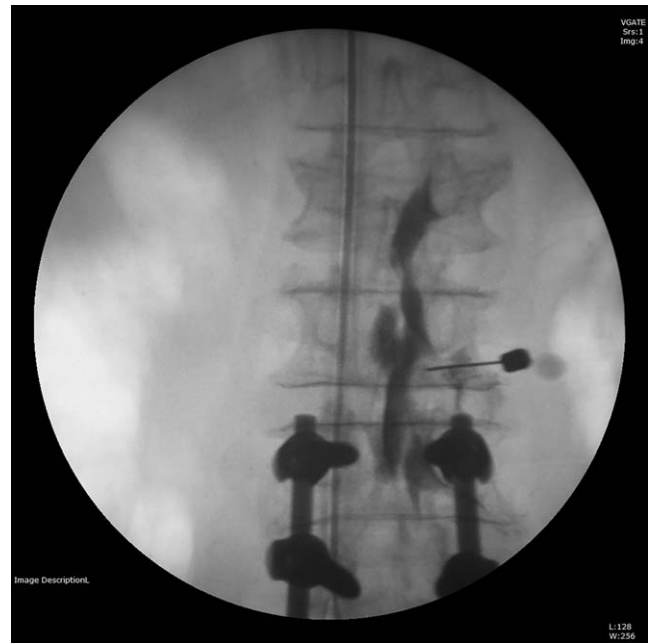
Figure 2. Fluoroscopic anteroposterior view showing contrast spreading from L1 to L3 epidural space during transforaminal epidural injection.

conservative treatment and L2-level root blocks several times. He also had a previous medical history of type 2 diabetes mellitus and hypertension but was not taking any medications. The patient's blood pressure was stable and the average of the blood pressure measurements taken on admission was 140/70 mm Hg.