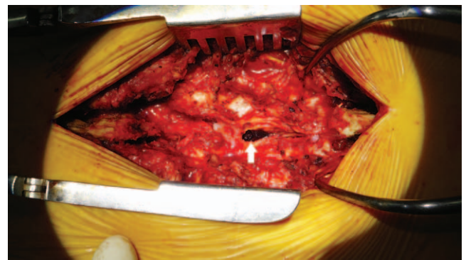
Figure 6. Intraoperative photograph showing a clotted mass of dark brownish hematoma at the T12 epidural space (arrow).

increase the likelihood of intravascular drug delivery, can lead to bleeding and hematoma formation. This risk is higher in patients taking anticoagulants and in patients with inherited and acquired coagulation disorders, but it can occur in patients without any history of medication use or other risk factors; therefore, considerable caution is required during the procedure. [9]