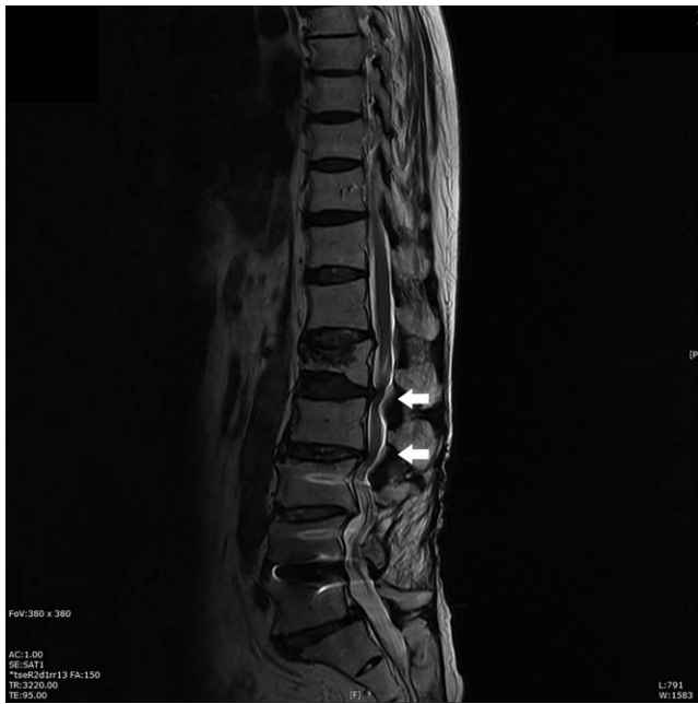
Figure 1. Lumbar sagittal T2 weighted magnetic resonance imaging showing lumbar spinal stenosis at L1-L3 (arrows).