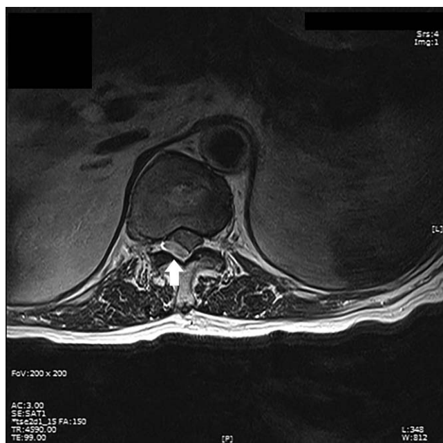
Figure 5. Lumbar axial T2 weighted magnetic resonance imaging showing heterogeneous signal intensity (arrow) at T12.

One of the causes of epidural hematoma is vessel injury near the foramen due to direct needle injury. [8] Vessel injury, which can