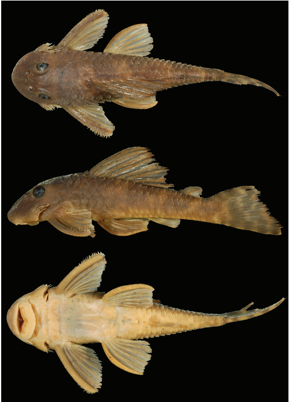
Figure 2. Dorsal, lateral, and ventral views of holotype of Peckoltia ehippiata sp. n., MCP 35627, 101.7 mm SL.