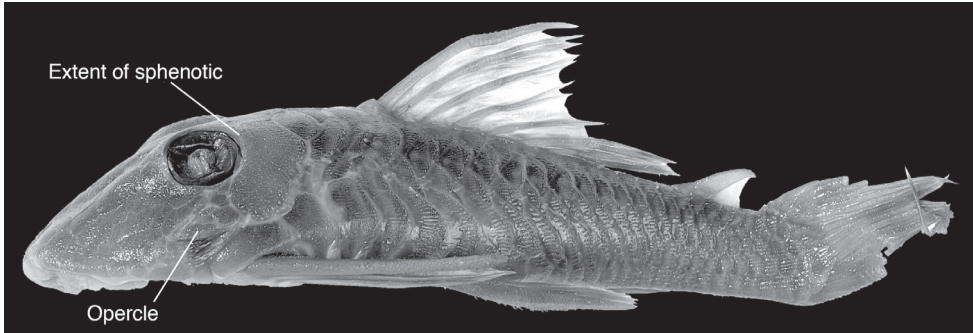
Figure 6. Lateral view of holotype of Chaetostomus macrops , ZMUC P30142, 92.7 mm SL.