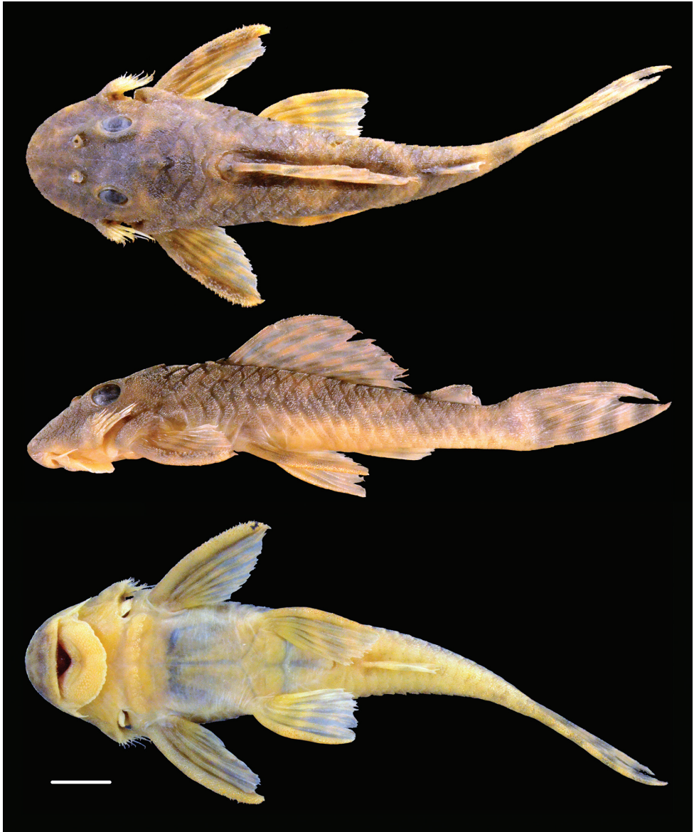
Figure 5. Dorsal, lateral, and ventral views of holotype of Peckoltia lujani sp. n., AUM 53523, 75.1 mm SL.

at Raudales Atures, 8.3 km SSW of Puerto Ayacucho, 05.5989°, -067.6139°, 23 Mar 2010, N.K. Lujan, D.C. Werneke, M.H. Sabaj, T. Carvalho, V. Meza; AUM 53979, 2, 31.6–34.3, VENEZUELA, Amazonas, rio Orinoco at Merey, 97.6 km N of San Fernando de Atabapo, 04.9178°, -067.8329°, 18 Apr 2010, J. Birindelli, N.K. Lujan, and V. Meza; MCNG 56579, 1, 62.9, MCP 48401, 1, 57.8, same data as holotype; ROM 93352, 12, 38.0–64.5, VENEZUELA, Amazonas, rio Orinoco across channel