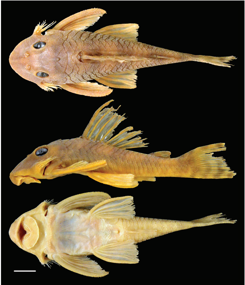
Figure 4. Dorsal, lateral, and ventral views of holotype of Peckoltia greedoi sp. n., MCP 21972, 77.8 mm SL.

head (vs. large dark spots or mottling); by having the eyes high on the head with the dorsal rim of the orbit higher than the interorbital space (vs. low on the head, dorsal rim of orbit lower than interorbital space), and by having small plates on the abdomen (vs. relatively large).