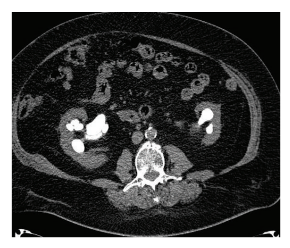
FIGURE 2: Preoperative CT scan.

A percutaneous treatment was impractical due to stones volume and complexity, obesity, and low compliance of patient for possible need of repeat treatments. A laparoscopic approach was not indicated because of the severe long standing COPD and previous open abdominal operations.