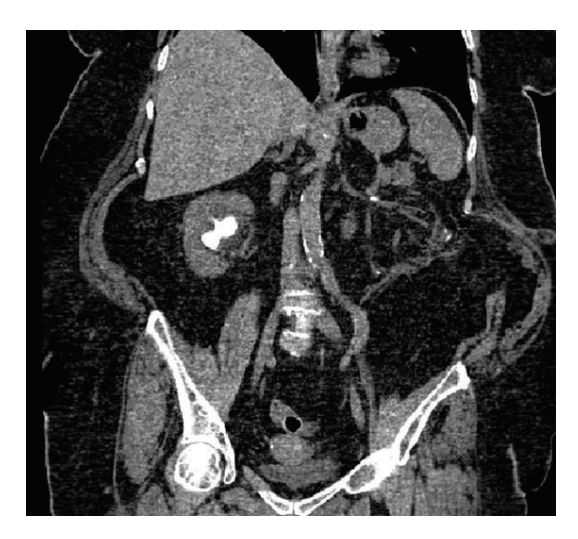
FIGURE 8: Postoperative CT scan.