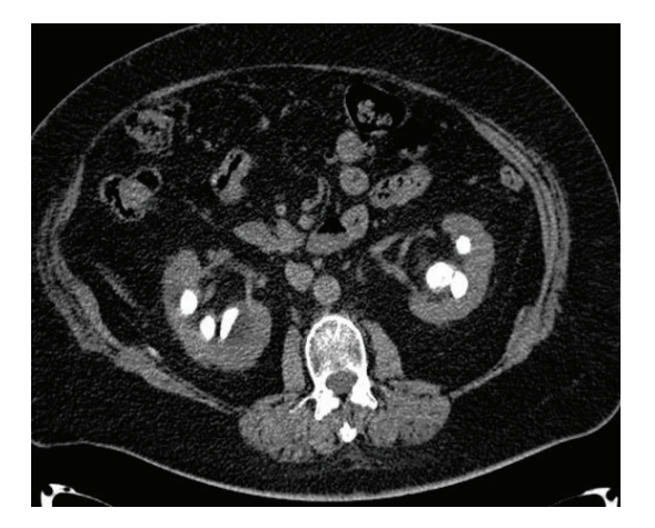
FIGURE 3: Preoperative CT scan.

The kidney was exposed through a flank incision on the 11th intercostal space. When access was gained into the retroperitoneal space, Gerota's fascia was longitudinally incised and perinephric fat carefully dissected off the entire renal capsule. The renal artery and vein were identified and the posterior segmental artery was isolated and temporarily clamped during the intravenous injection of 20 mL of methylene blue to identify Brodel's line. The main renal artery and vein were then occluded with bulldog clamps. and cold ischemia was performed surrounding the kidney with ice slush. Dry