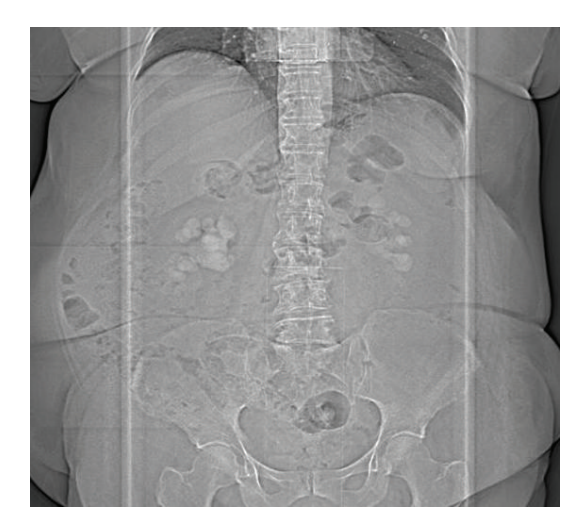
FIGURE 1: Abdominal X-ray.