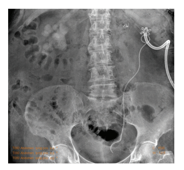
FIGURE 7: Postoperative abdominal X-ray.

In the last few decades, surgical approach to stone treatment has changed dramatically. ESWL and Endoscopic treatment have virtually eliminated the need for open surgery in kidney and ureteral stones [1, 2]. The advent of laparoscopic stone removing procedures has further reduced the need to perform open surgery, even anatrophic nephrolithotomy [3– 10]. The great limitation of laparoscopic surgery resides in patients' comorbid conditions such as: severe heart failure,