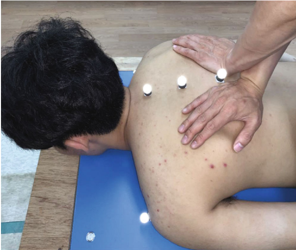
FIGURE 2: Posterior to anterior thoracic spinal manipulation (TSM).

participant's position was stabilized, and he/she was asked to inhale and fully exhale. At the end of the respiratory cycle, the therapist delivered a posterior to anterior impulse to the target spinal level (Figure 2).