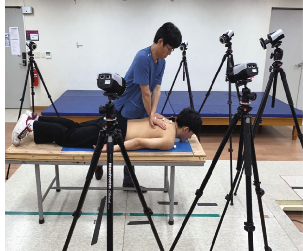
FIGURE 3: Infrared cameras.

2.6. Statistical Analysis. TSM force data from the force plates and camera were collected using PowerLab data acquisition and Chart software version 4.2.4 (ADInstruments, Castle Hill, Australia) and calibrated using Qualisys Track Manager (Track Manager version 2.5, Qualisys). In this study, x -, y -, and z -axes were the lateral, horizontal, and vertical coordinates, respectively, for the determination of the magnitude and direction of forces transmitted during TSM in 3 dimensions [21]. The x -axis represents the criteria for the left and right sides of participants lying in prone position, and the force applied to