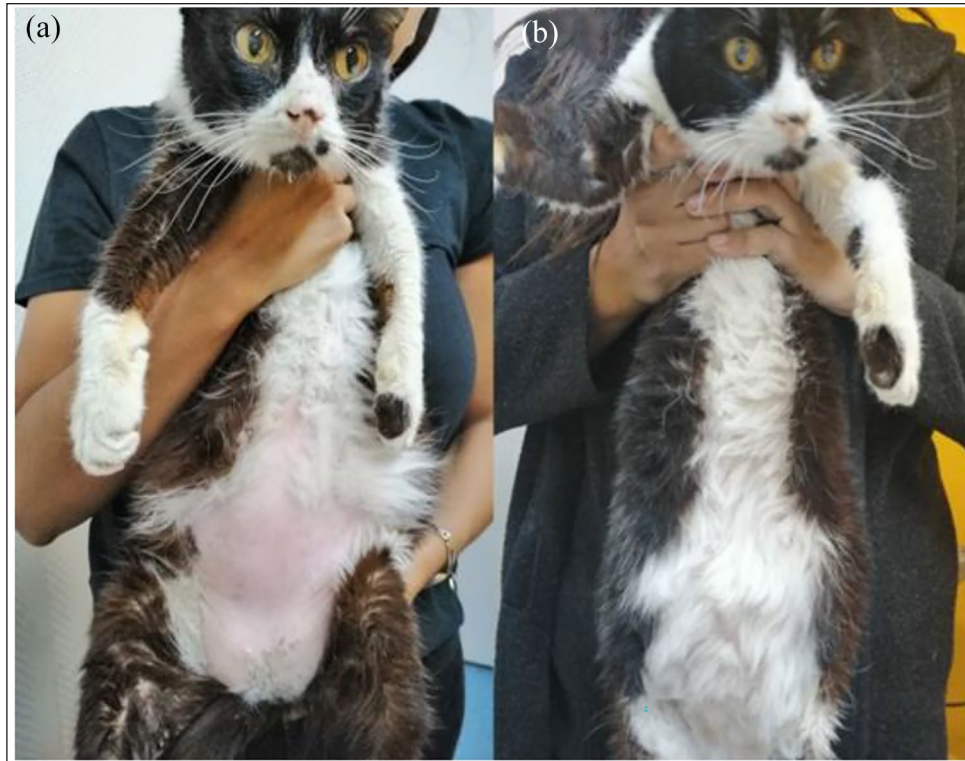
Figure 4 Clinical appearance of the cat, ventral view: (a) at diagnosis of hypoadrenocorticism and (b) at month 3 of cabergoline treatment. After treatment with cabergoline, the abdominal distension was reduced and the alopecic areas were covered with new hair

therapy, for a minimum of 28 days. 9 The cat in this report fulfilled these criteria. Feline diabetic remission was previously described in cats with HAC treated with trans-sphenoidal hypophysectomy, unilateral and bilateral adrenalectomy, pituitary irradiation and also with trilostane. 10–13 In diabetic cats (type 2DM), diabetic remission most often occurs within the first 6 months after the diagnosis of DM. 14 In our cat, diabetic remission was achieved rapidly: around 30 days after insulin therapy and, surprisingly, 3 days after cabergoline treatment with clinical signs of hypoglycemia. In cases of feline secondary DM, such as in this report, diabetic remission could be achieved once the underlying inducing disease is treated effectively. 13,14 However, it is important to highlight that treatment with cabergoline was only associated with diabetic remission and that it is possible that the diabetic remission occurred independent of the treatment with cabergoline.