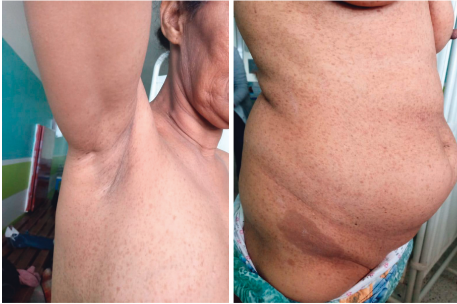
FIGURE 1: Hyperpigmented skin macules with multiple café-au-lait spots, axillary, and inguinal freckling in her mother.