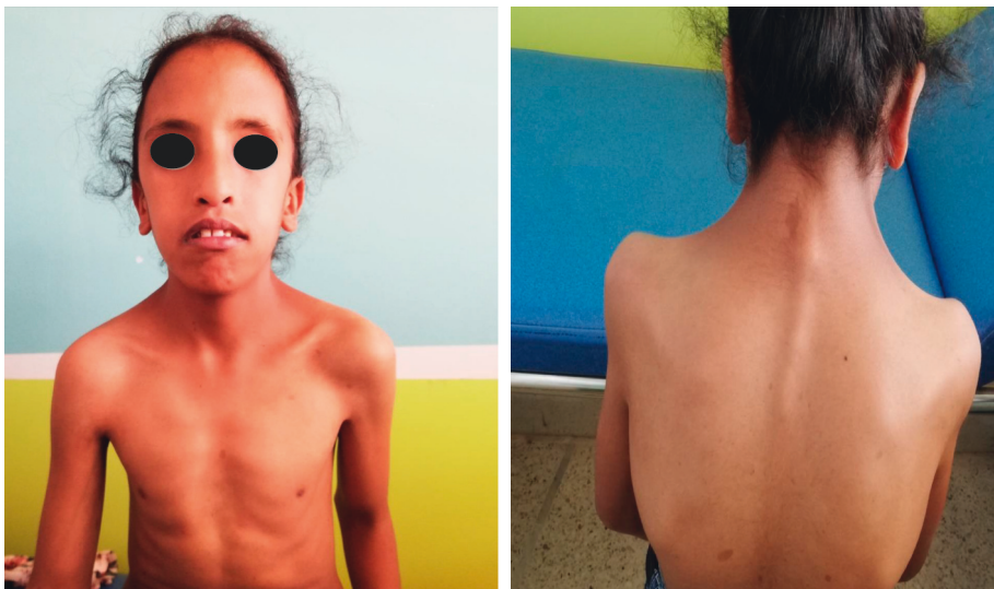
FIGURE 2: Characteristic appearance with webbed neck, shielded chest, and a low posterior hair line.

of gonads with hypoplastic uterus. Kidneys, ureters, and bladder were normal. Skeletal maturation, evaluated by a left wrist X-ray according to the technique of Greulich and Pyle, was 15 years. Serum IGF-1 level was within normal limits. A brain and pituitary MRI to exclude pituitary lesions or structural abnormalities showed normal results. Her eyes showed Lisch nodules without clinical visual involvement during ophthalmologic examinations (Figure 4).