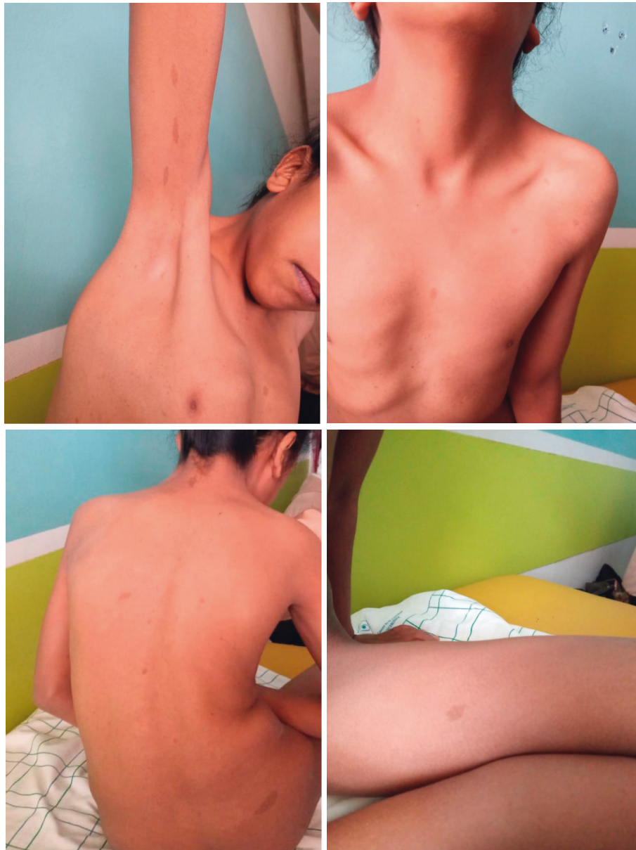
FIGURE 3: Hyperpigmented skin macules with multiple café-au-lait spots and axillary freckling in our patient.

NF-1 represents a major risk factor for development of malignancy, particularly malignant peripheral nerve sheath tumors and optic gliomas, and malignancy is an important component of the NF-1 phenotype and one of the few potentially fatal complications [4].